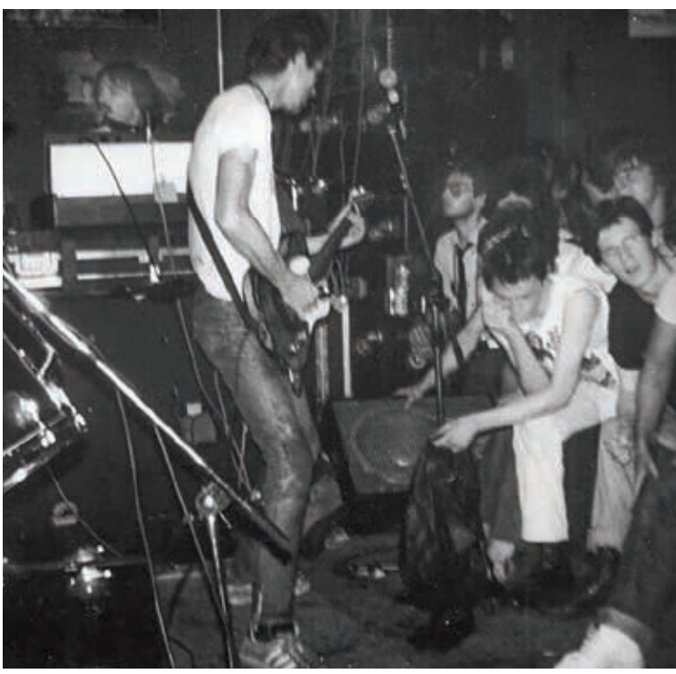
Nice 'n' sleazy: The Stranglers play the Herbert Wilmot Centre in August 1977.

Forty years on from their East Finchley debut, The Stranglers are still playing live. Later this month they're in Belfast, then later in the year they will be touring France before moving on to New Zealand and Australia early next year.