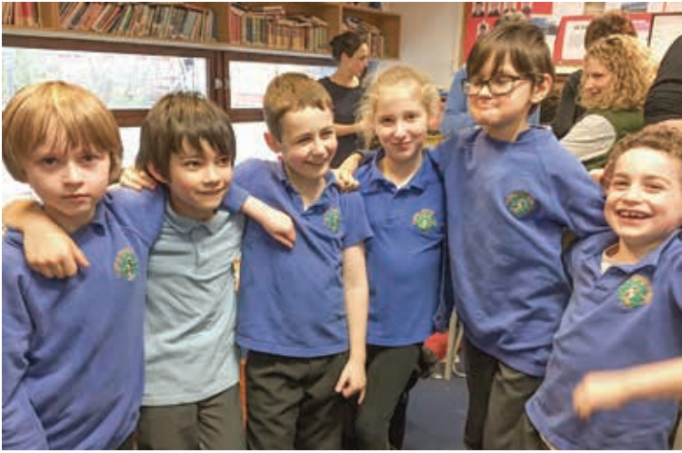
Chess champs: The Coldfall Primary U9 team