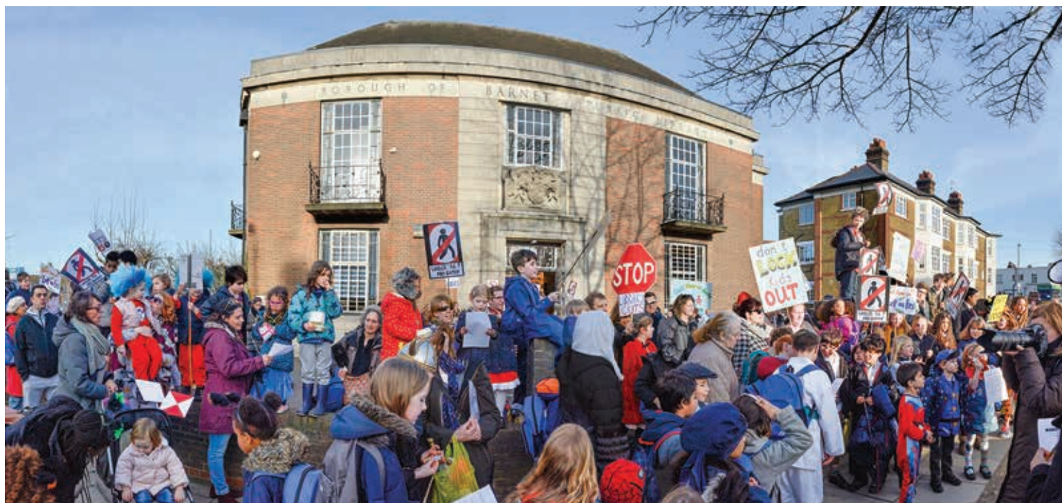
National Book Day protests against library closures in East Finchley.

A community newspaper for East Finchley run entirely by volunteers.