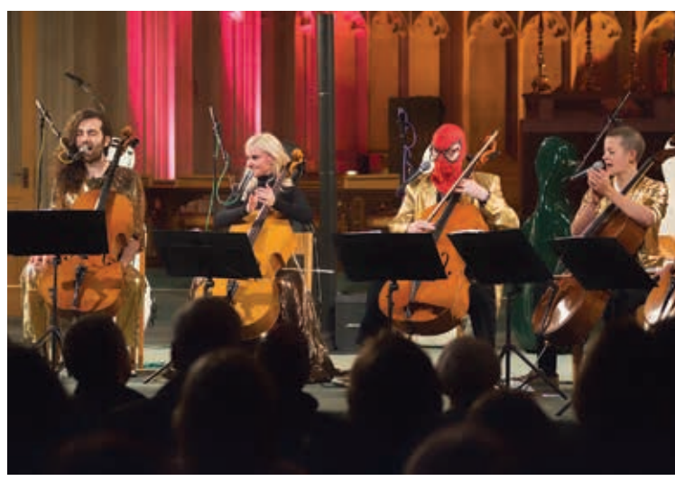
The Massive Violins