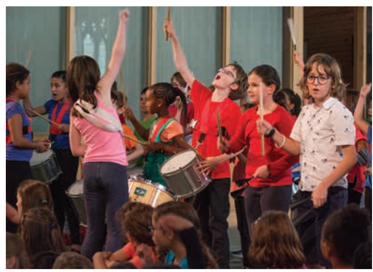
Manorside and Martin School Choirs