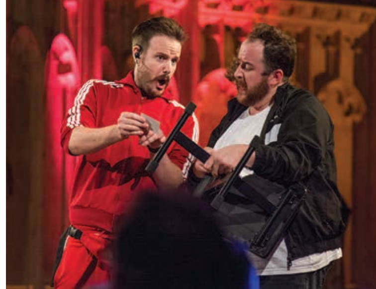
Pop-up Opera - Barber of Seville.