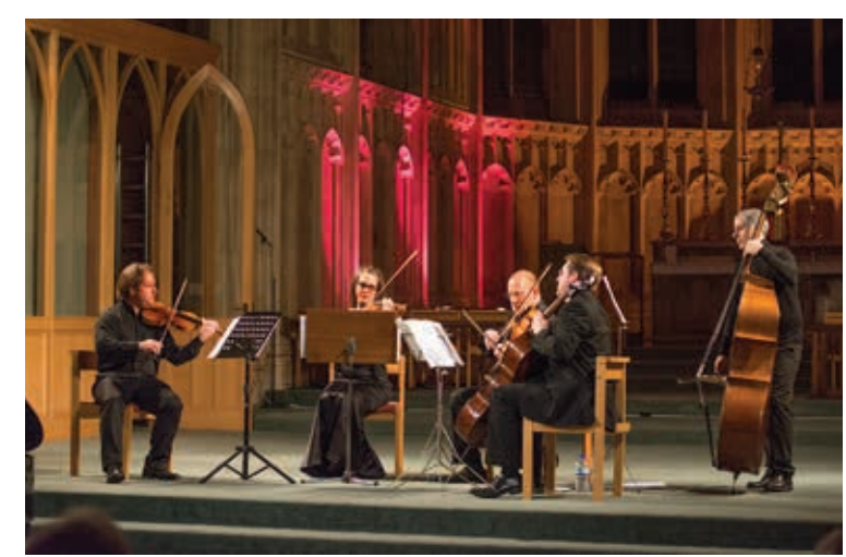
The Orfeas Ensemble