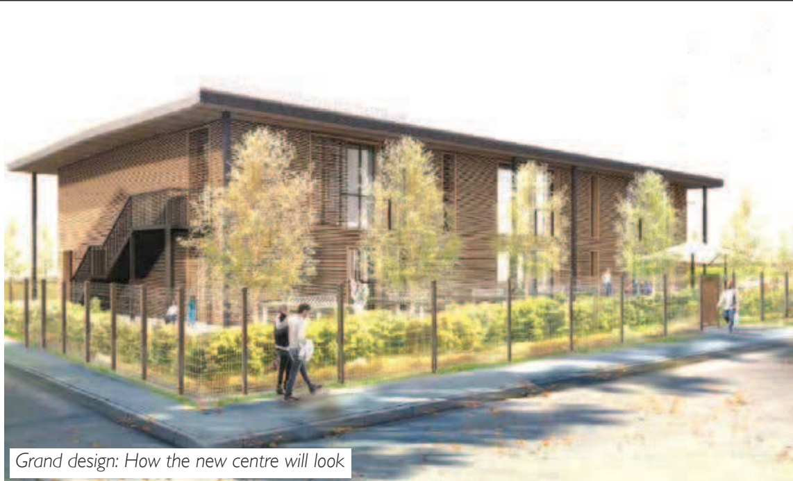
Grand design: How the new centre will look

A campaign has now been launched to put pressure on the government to stop the cuts and so save independent pharmacies. Residents are encouraged to visit their local pharmacy to hear details and to join the campaign, which includes an e-petition, letters to MPs and lobbying of ministers. Information can also be found on www.supportyourlocalpharmacy.org .