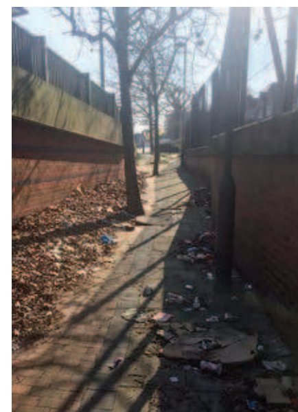
Litter: The High Road / North Circular underpass

A resident who regularly uses The Walks said: "The dog