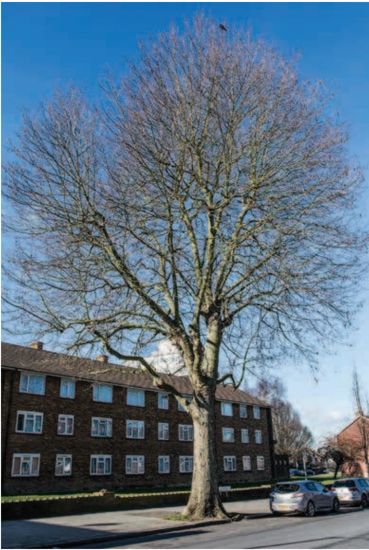
"The starling tree" in the High Road.