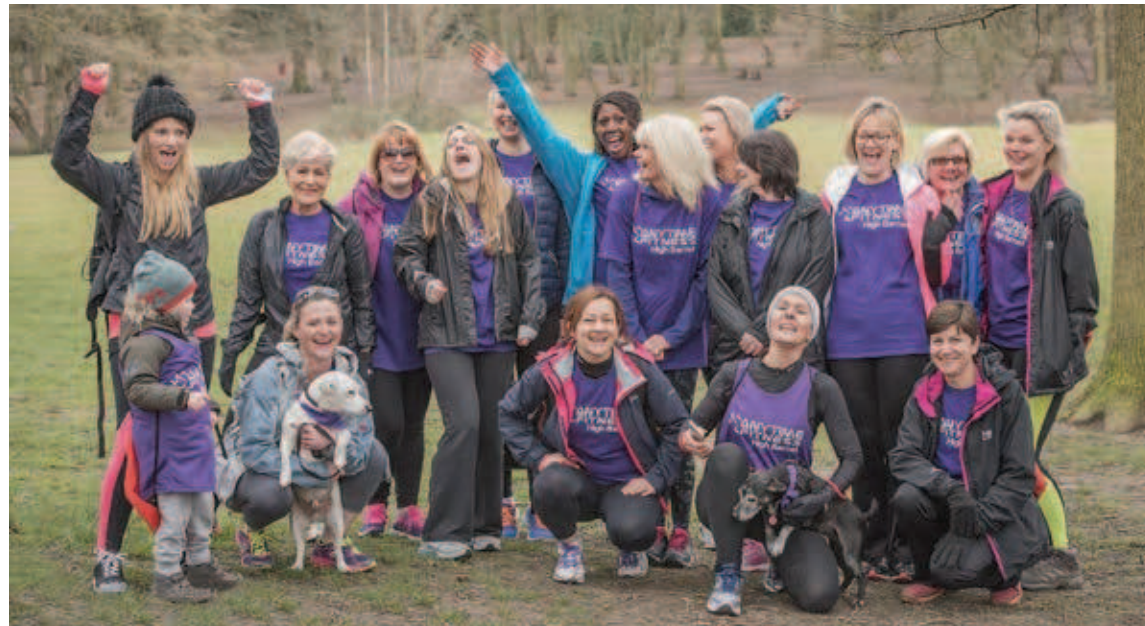
On their way: Walkers and their four-legged friends set off from Cherry Tree Wood.