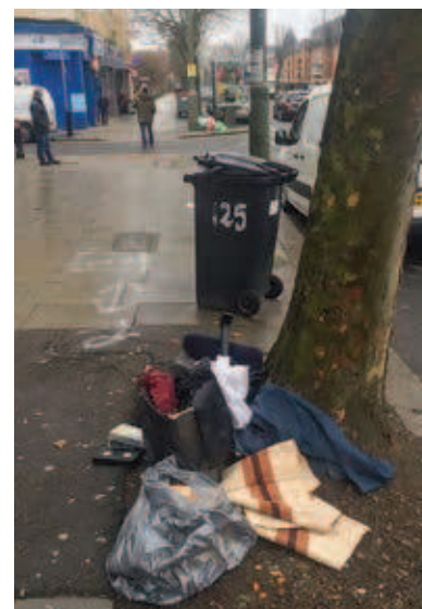
Dumped: Items left on the pavement in the High Road