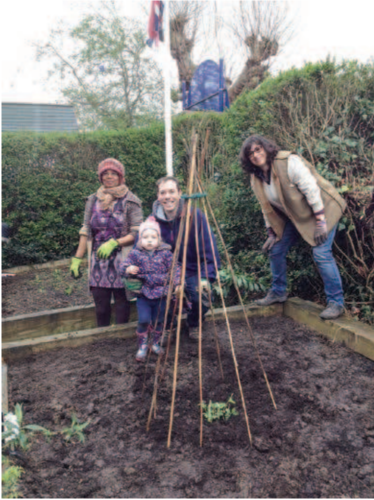
How does your garden grow? A community plot is being opened for all-comers