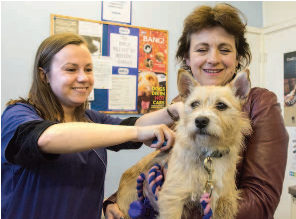
'Doggy ID: A visitor to the RSPCA clinic is microchipped.

A community newspaper for East Finchley run entirely by volunteers.