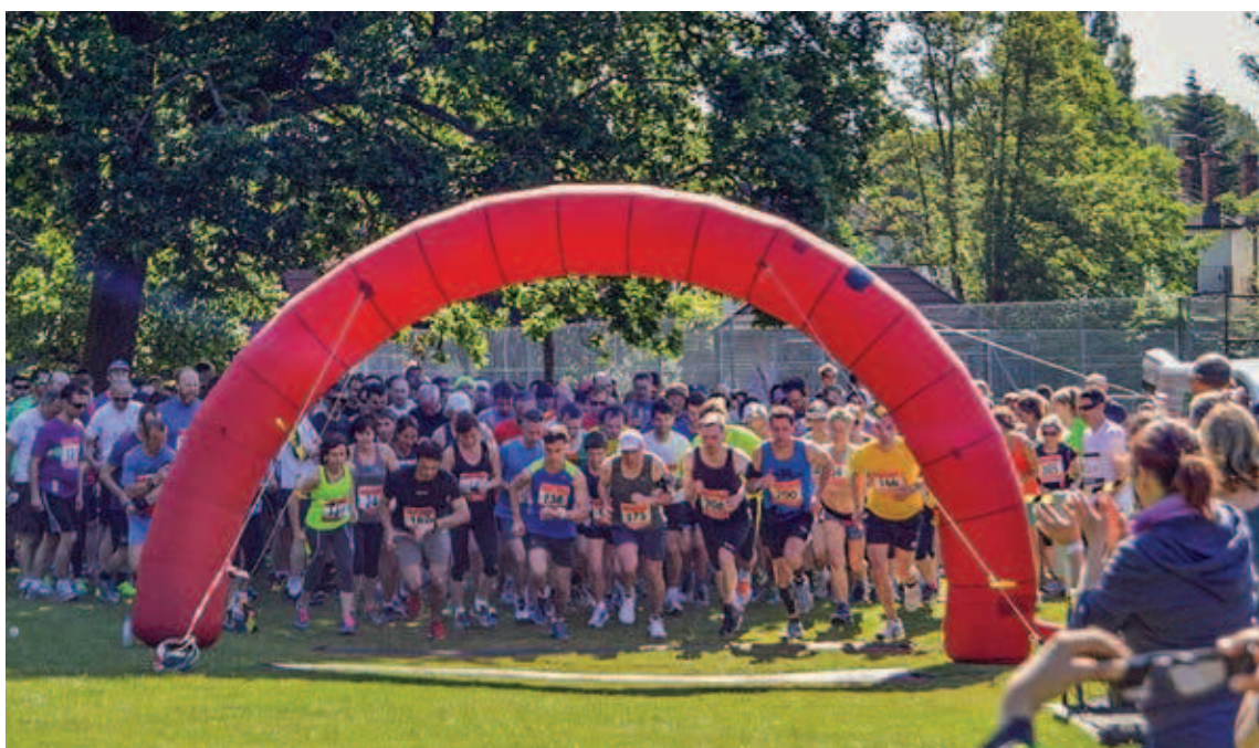
Friendly rivalry: Race the Neighbours last year