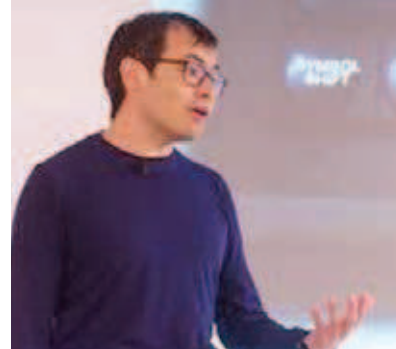
Way ahead: Demis Hassabis

Following graduation from Cambridge University with a