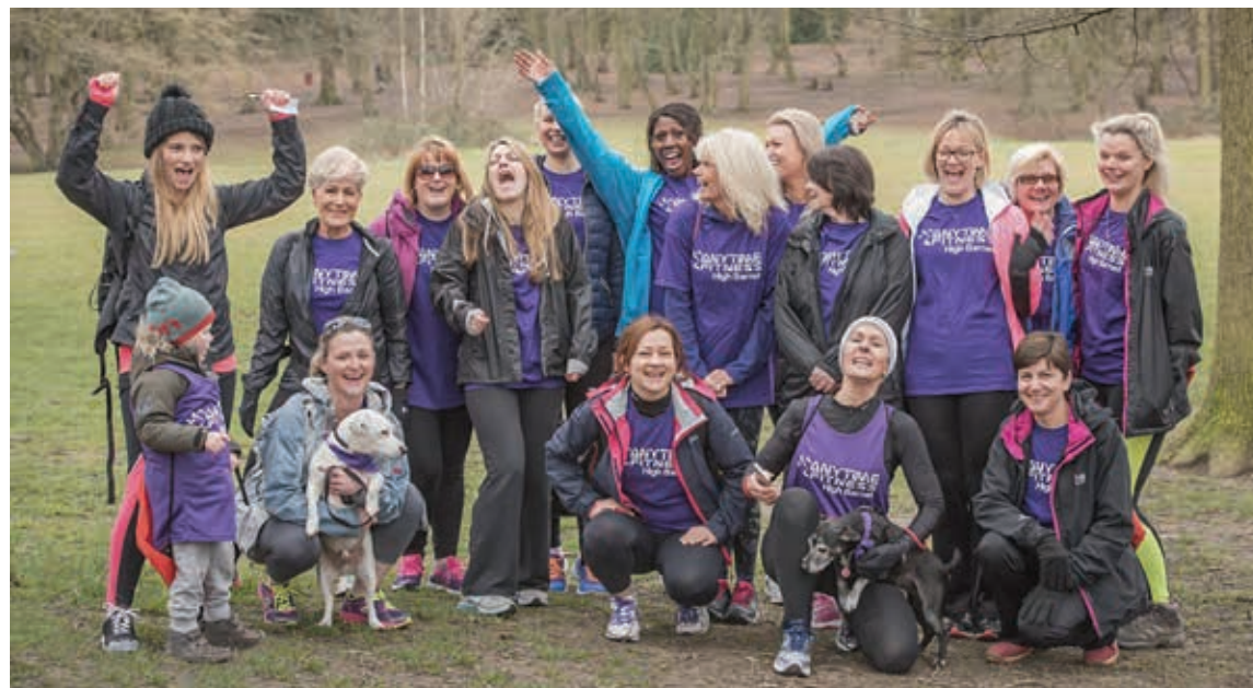
On their way: Walkers and their four-legged friends set off from Cherry Tree Wood.