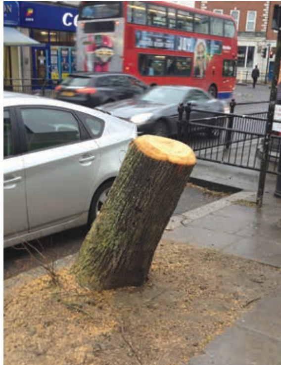
Left: A new tree planted outside Budgens where the old one was dug up. Right: the old tree.