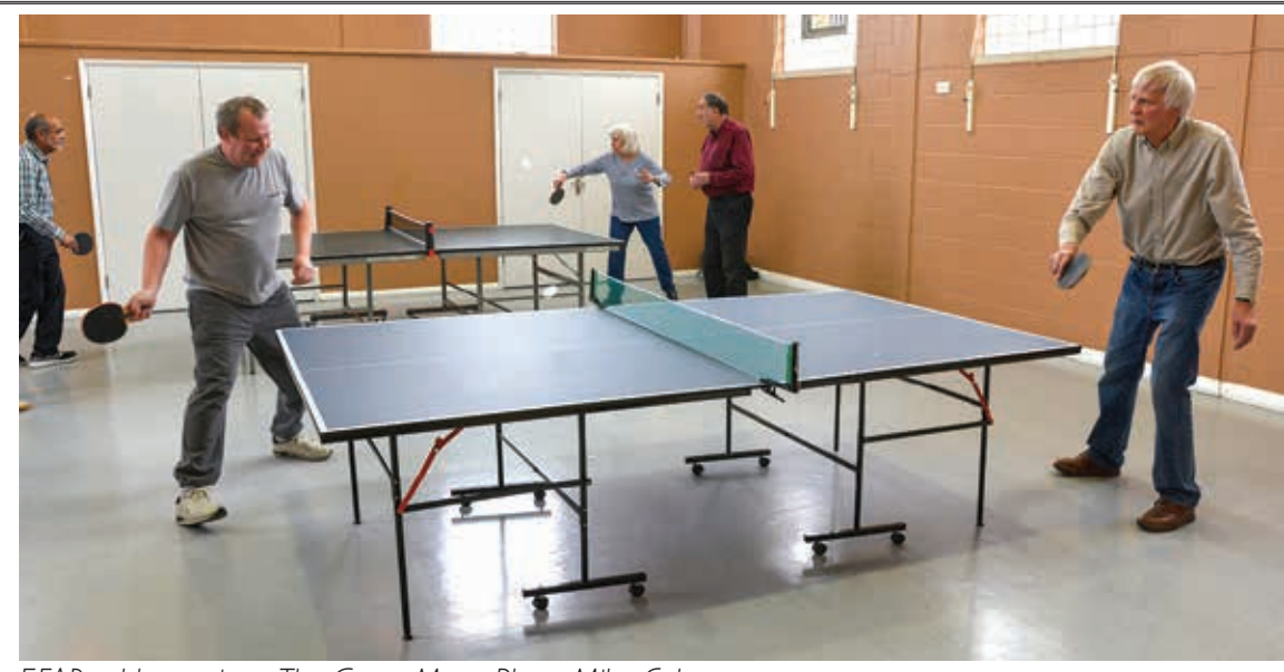
EFAB table tennis at The Green Man.

Shoppers on the High Road had the chance to enjoy a pop-up exhibition of photos by East Finchley Open artists on show for free in the windows of Budgens for two weekends in May. The images were the first to emerge as part of a project documenting people, traders and life in the High Road.