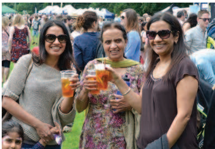
Sunshine and smiles