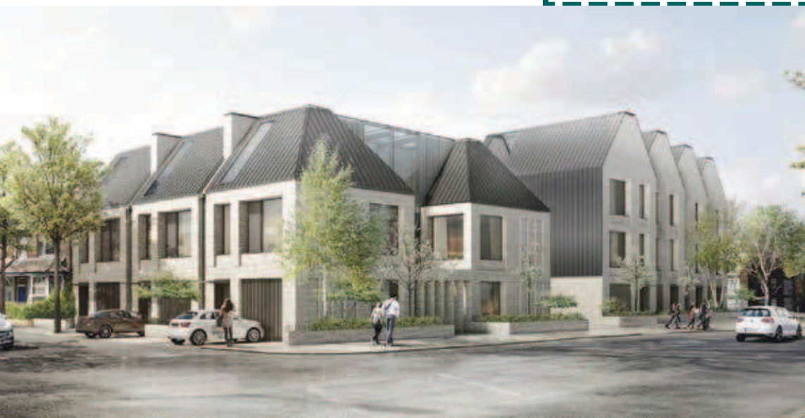
New homes: How the former Esso site could look