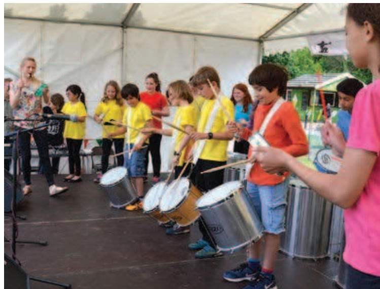
Martin School Samba Band