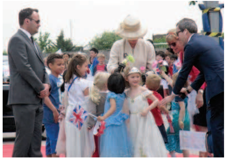
VIP visit: The mystery 'royal' arrives at Coldfall Primary

A regal mystery guest arrived to mark the 90 th birthday of the Queen. Dressed in red, white or blue and waving flags in the playground, the year two pupils had plenty to say after she left, including: "Was it really the Queen?", "I thought she would have had a bigger car" and "Was she wearing washing up gloves?"