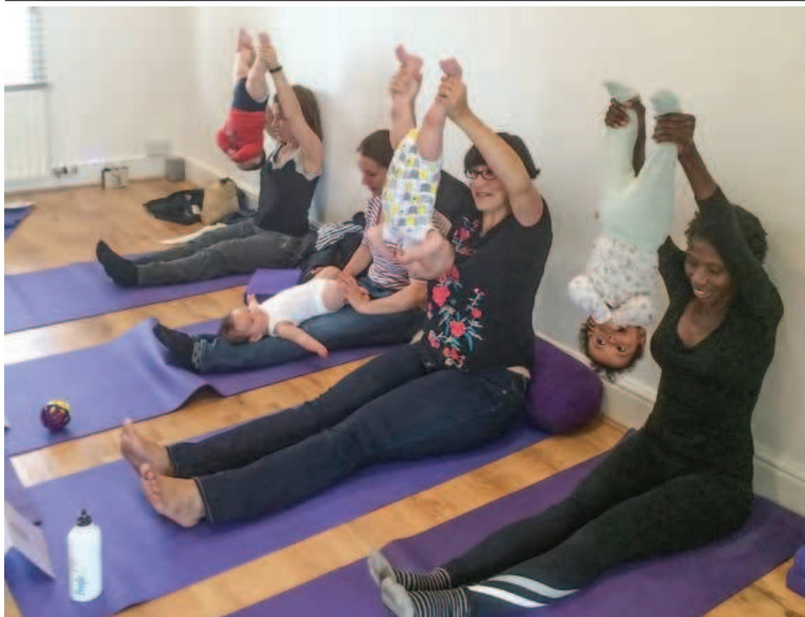
Hang in there: Babies and mums at the baby yoga classes