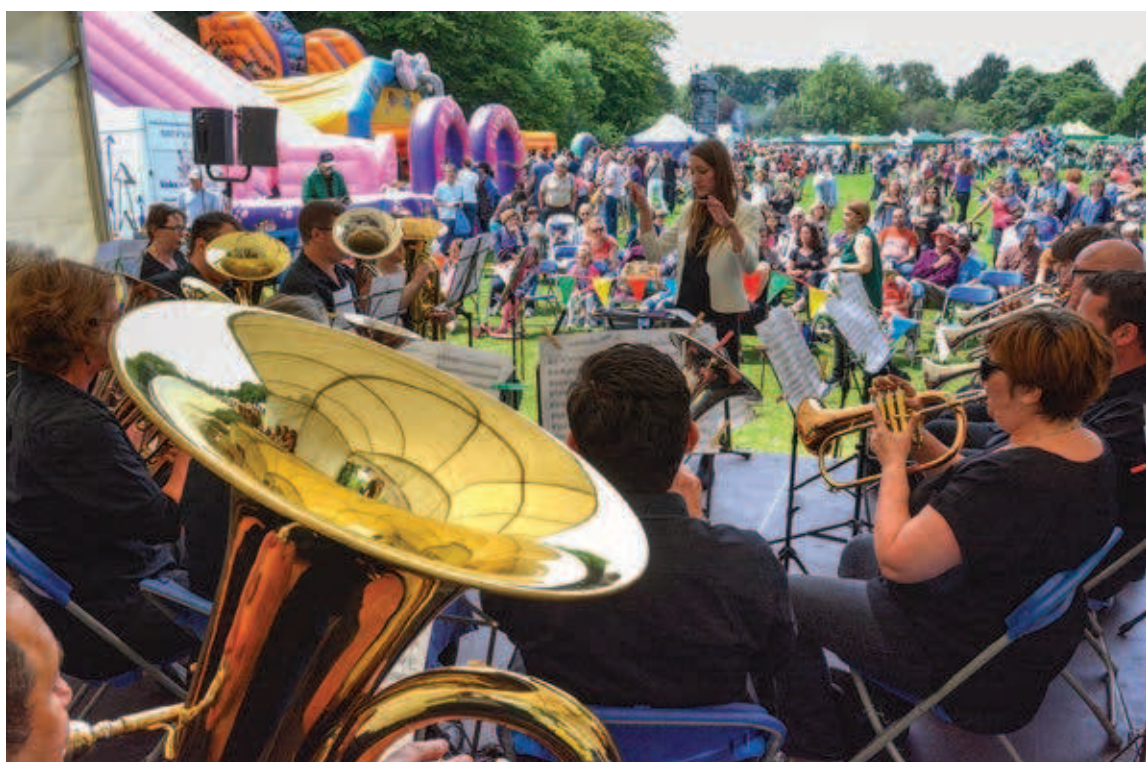
The Metropolitan Brass Training Band