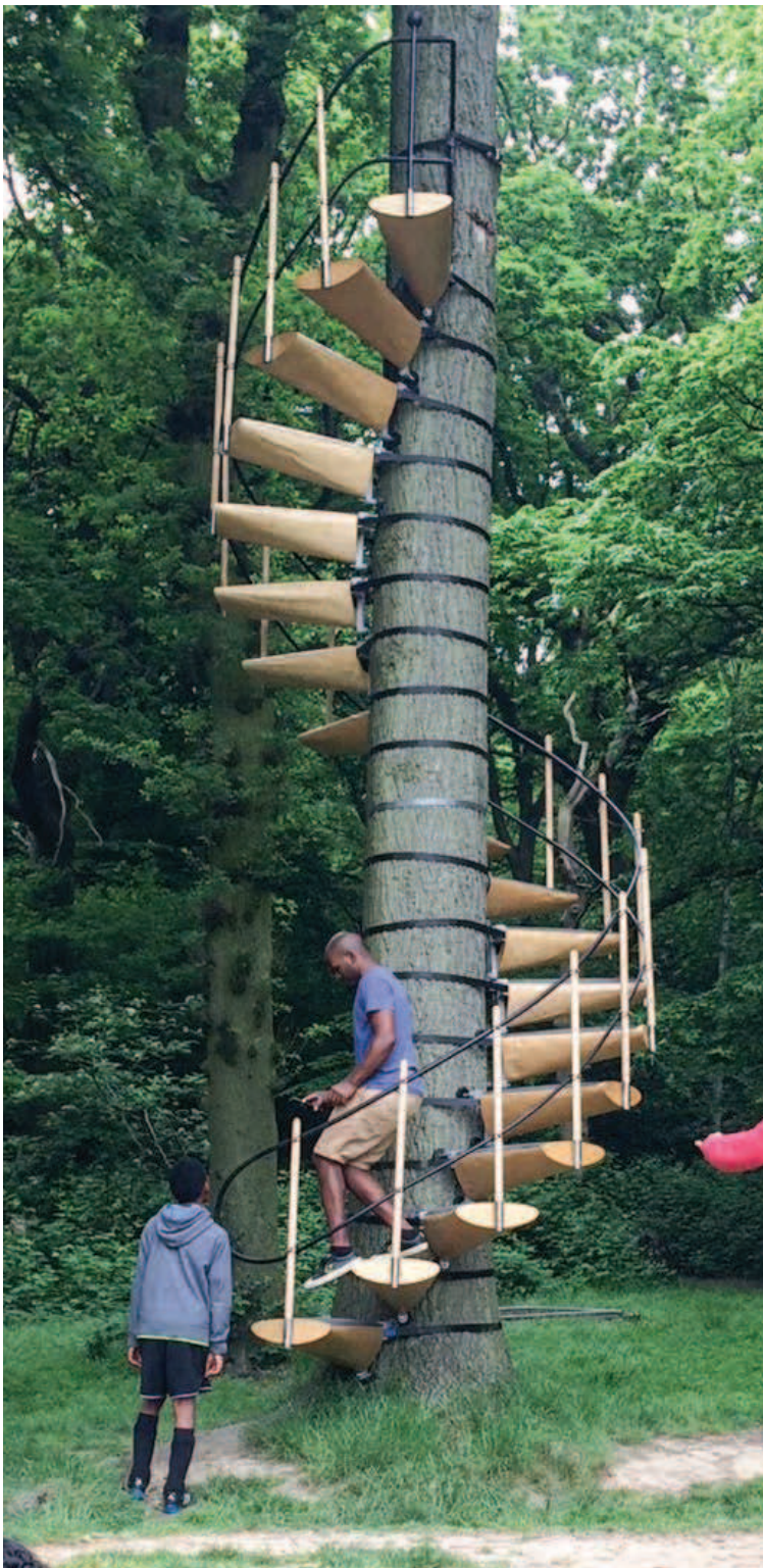
Ladder to the treetops: The tree stairs in Highgate Wood.

Published by East Finchley Newspapers, P.O. Box 3699, London N2 8JA. www.the-archer.co.uk