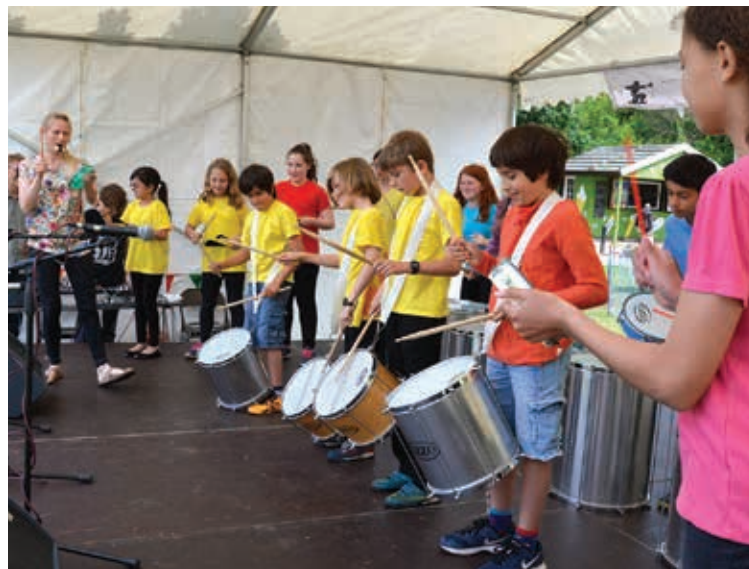
Martin School Samba Band