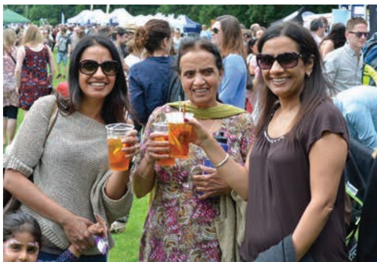
Sunshine and smiles