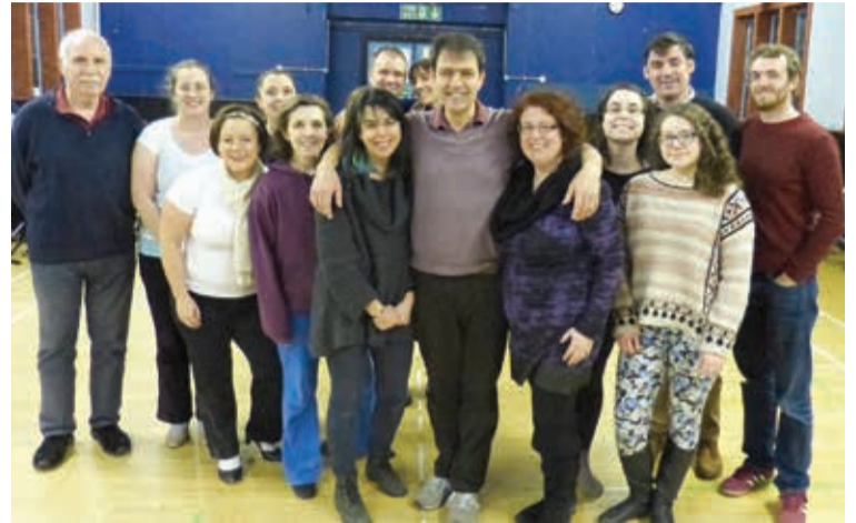
Show time: The cast of Cabaret

Cabaret will be performed at the Lund Theatre, UCS, Frognal, Hampstead on 16-20 February at 7.30pm with a matinee on Saturday 20 February. Tickets cost £12 (£10 concessions). To book, visit www.ticketsource.co.uk/gardensuburbtheatre or call 020 7723 6609.