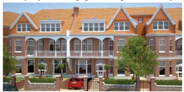
New look? Plans are afoot to turn the Raglan Hotel into flats

director of property company Safeland who bought the threestar hotel 18 months ago, told the Ham & High newspaper last month that the 50-bed Raglan had been unviable for many years and was falling into a state of disrepair.