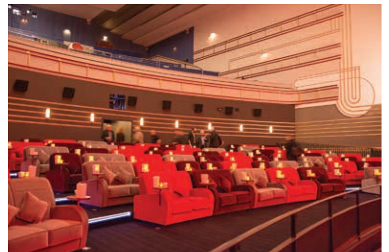
The opening of the new Everyman Cinema in Muswell Hill.