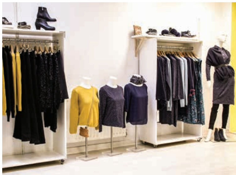
All grown up: Ryker's new range

The new Sorbet Beauty Salon at 80 High Road will be taking part, offering party makeovers and goody bags. Drinks will be provided by Table Du Marche and sweet treats by La Dinette. Visit www.rykerkids.com for full details and how to obtain tickets, which are free but limited to 50.