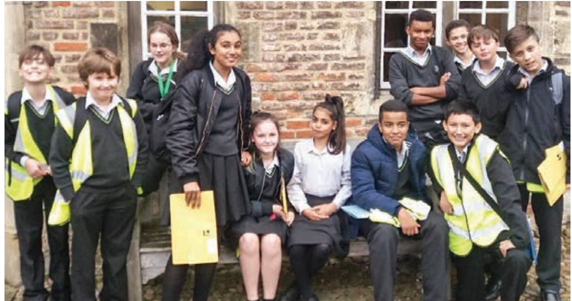
Grand day out: The Archer Academy students at Cambridge