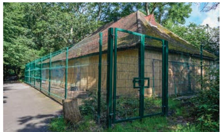
The current state of the Cherry Tree Wood pavilion.

What do you think should happen to the pavilion and how could the park be improved? Let THE ARCHER know. Our contact details are above.