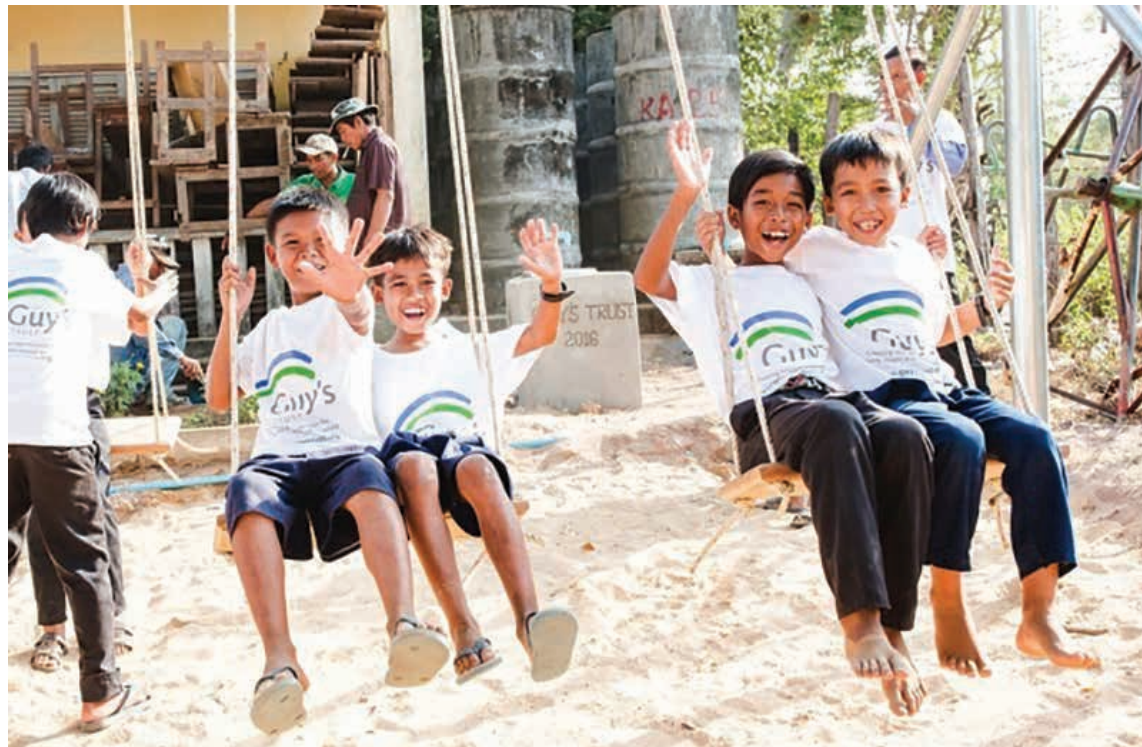
Play time: Boys try out the swings in the new playground