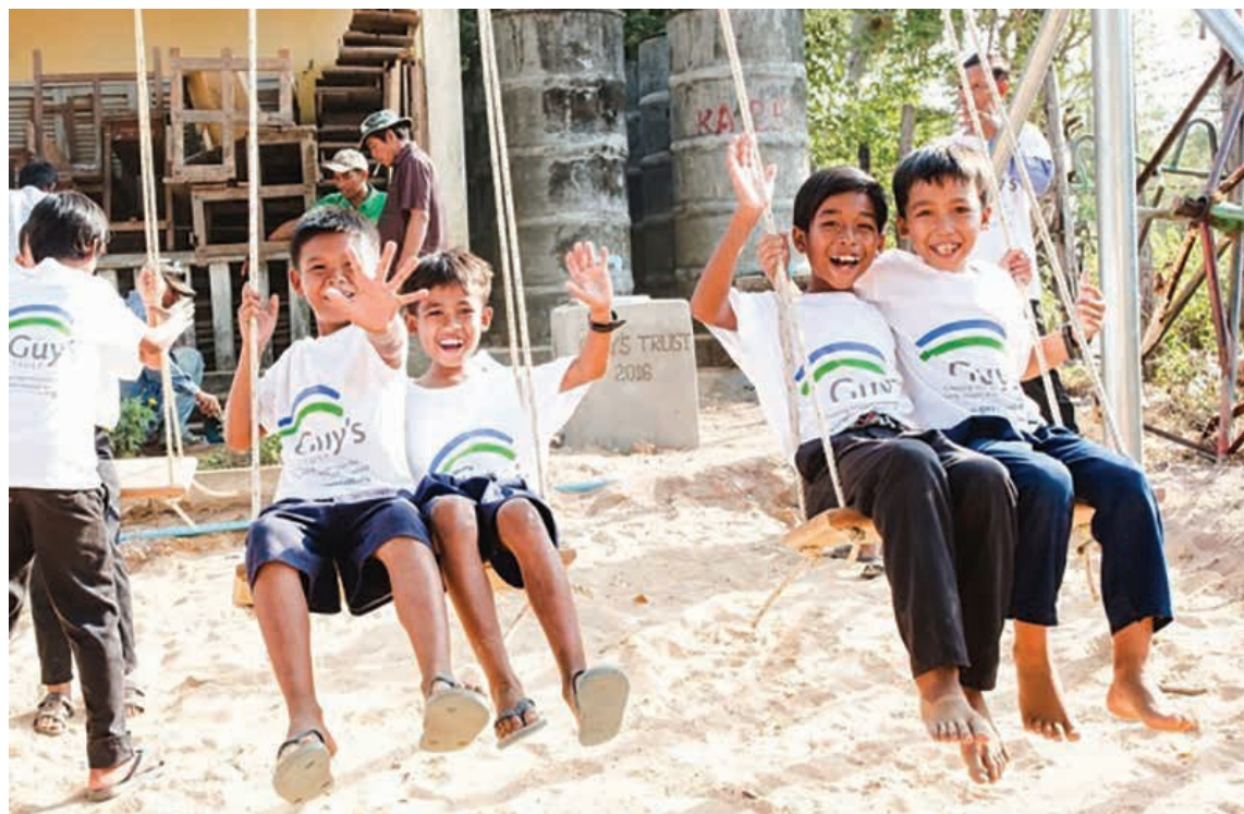
Play time: Boys try out the swings in the new playground