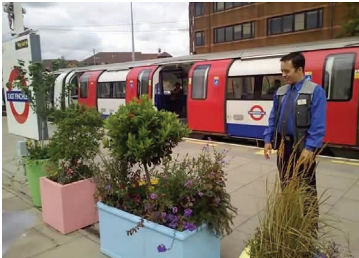
Green transport: Some of the plants beautifying East Finchley station.

Yours faithfully, Carey Miller, Address supplied.