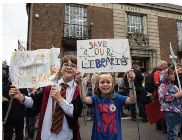
Harry Potter joins the kids at the library.