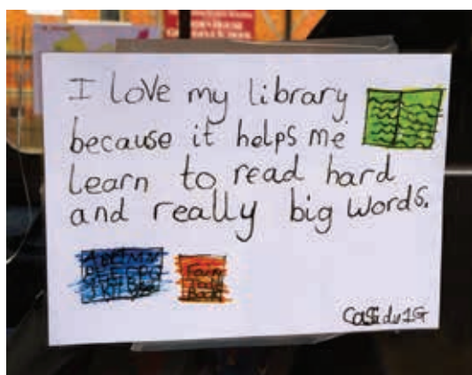
Two of the children's posters.