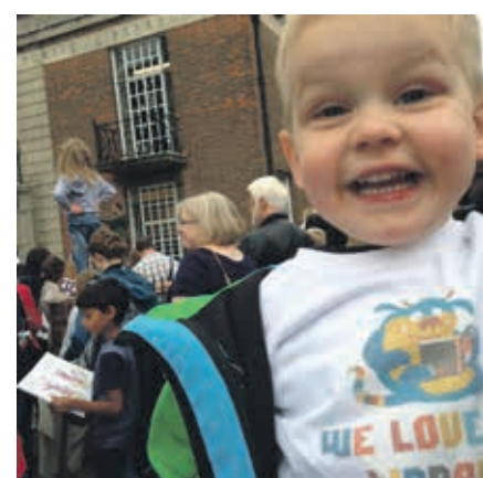
A young library user proudly shows off his reading monster t-shirt

"Libraries are cheap. Illiteracy is expensive." "Hands off our libraries!" "Save libraries. Save communities."