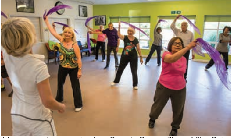
Movement classes at the Ann Owen's Centre.

www.eastfinchleyclinic.co.uk 020 8883 5888 2-3 Bedford Mews Bedford Road London N2 9DF