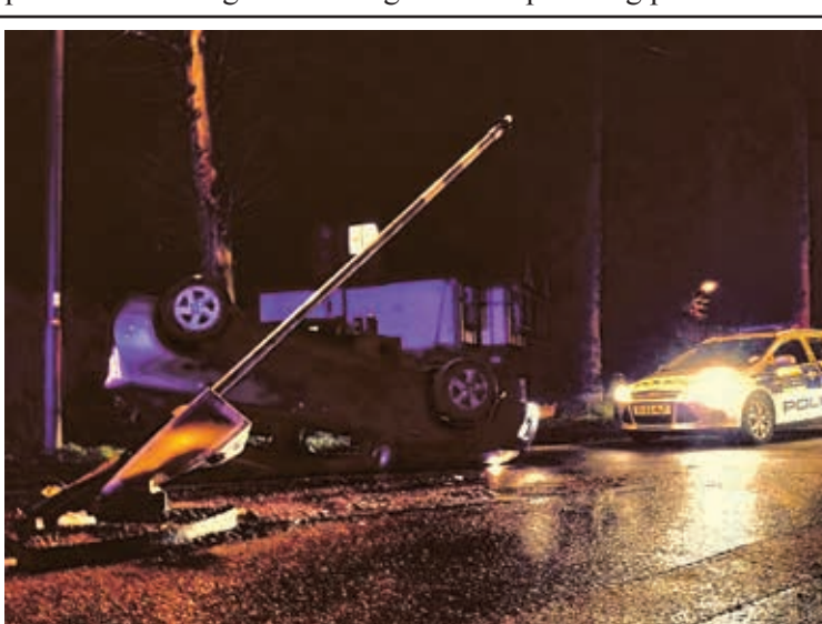
Police attend the accident on East End Road.

& garden maintenance. No Job Too Small Free Estimates Call John on: 0789 010 3831 or: 0208 883 5325