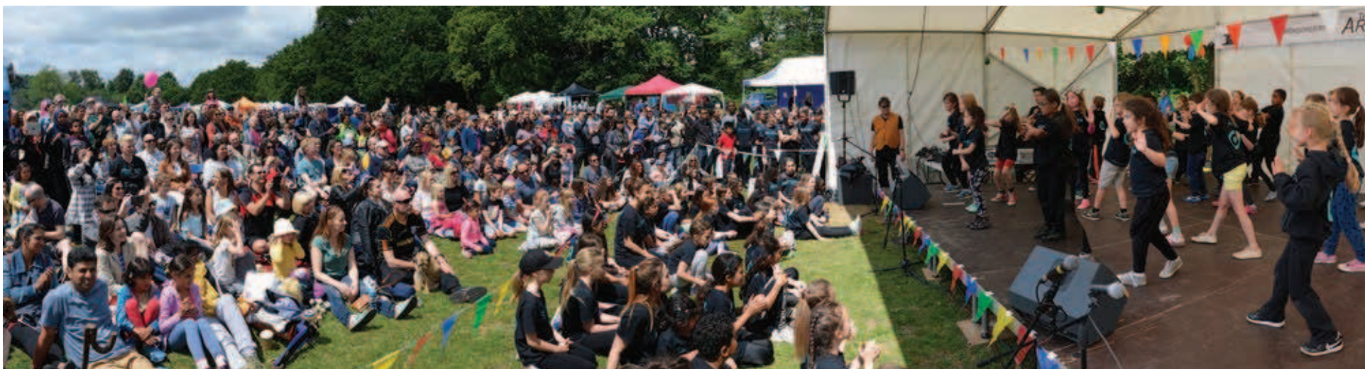
Crowds enjoy the entertainment in Cherry Tree Wood