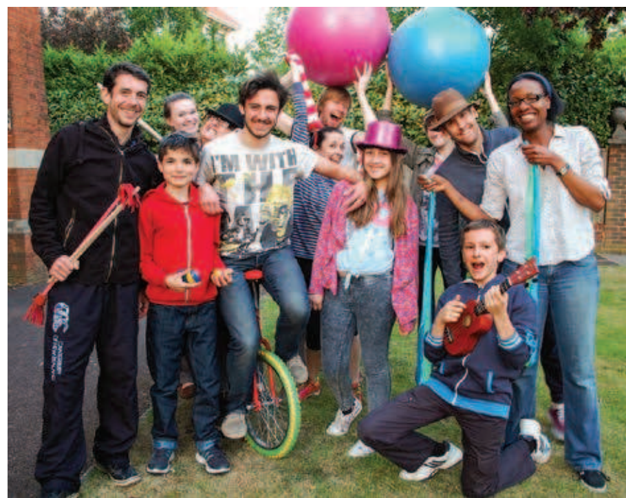
Roll up! Garden Suburb actors polish up their circus skills.

17–18, 22–25 July at 7.30pm and 18 and 25 July at 3pm. Tickets cost £10 (£8 concessions).