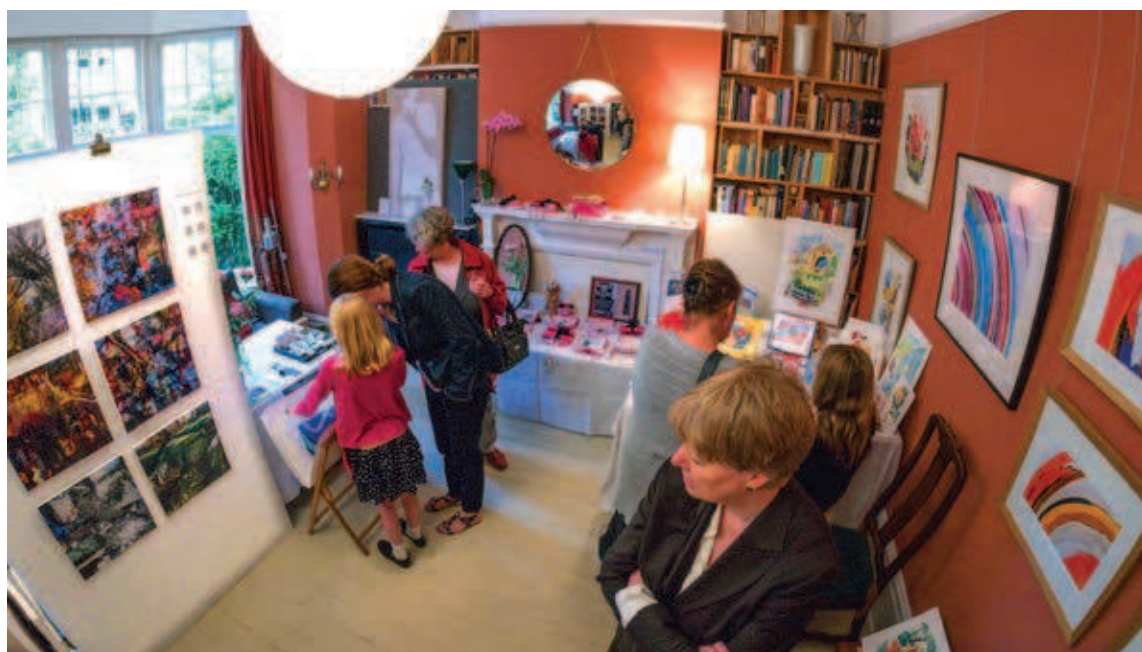
EFO artists' open house weekends are back this month.