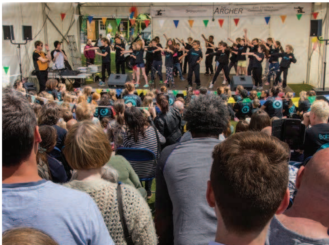
Fortitude Dance Company on The Archer stage.