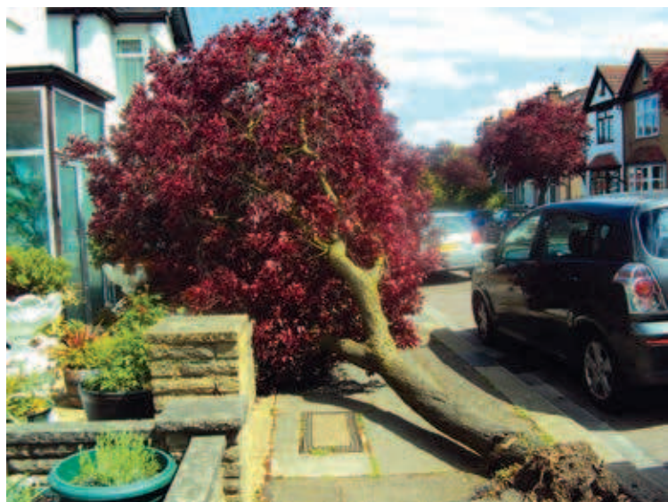
Casualty: The fallen tree in Chandos Road.