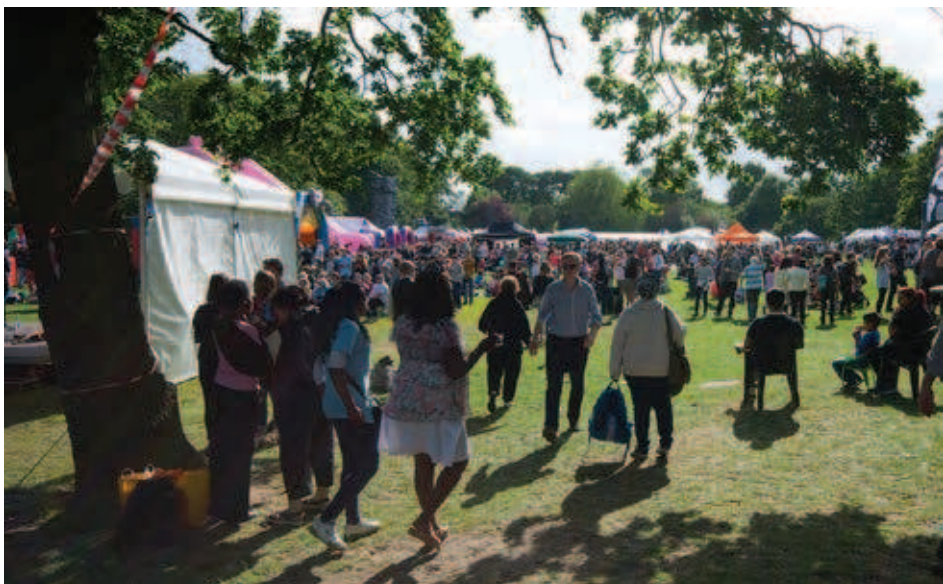
Sunny at times!