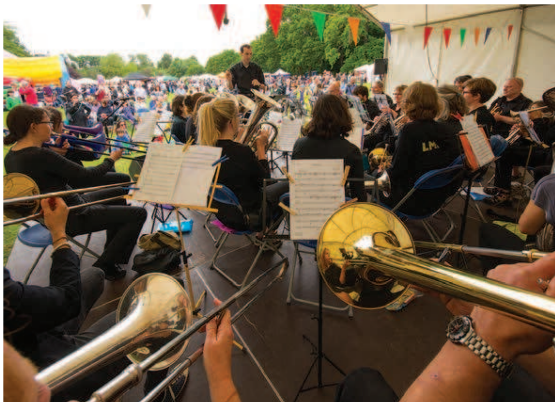
London Metropolitan Brass Training Band.