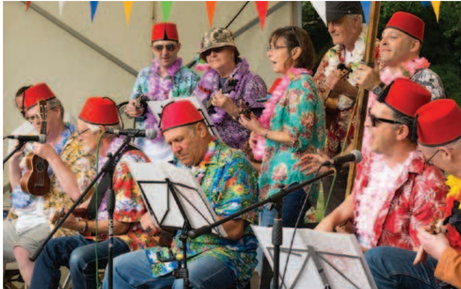
S.O.U.P. ukelele band.