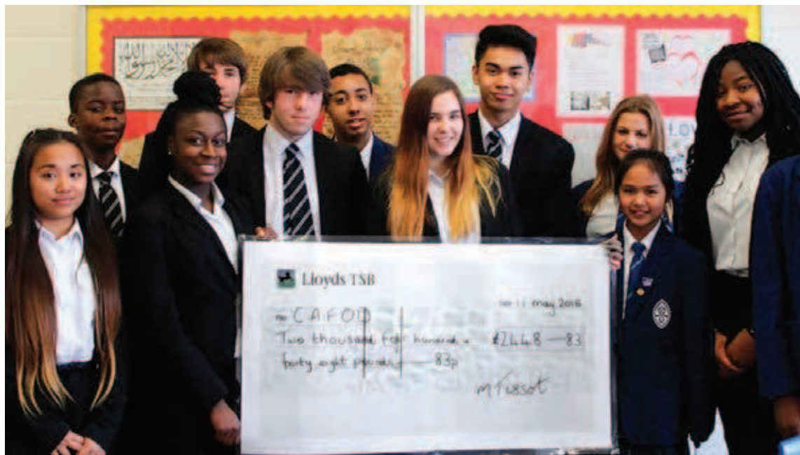
Emergency aid: Bishop Douglass pupils with their fundraising cheque.