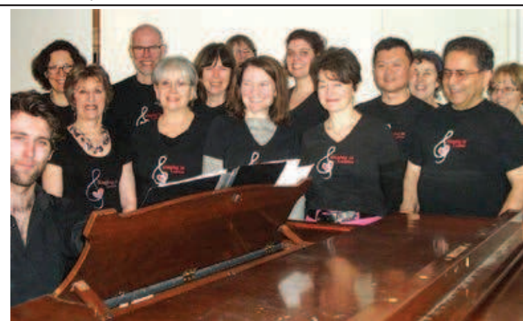
On the move: The Singing in London Club.