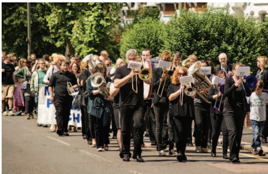
The Parade to Cherry Tree Wood.