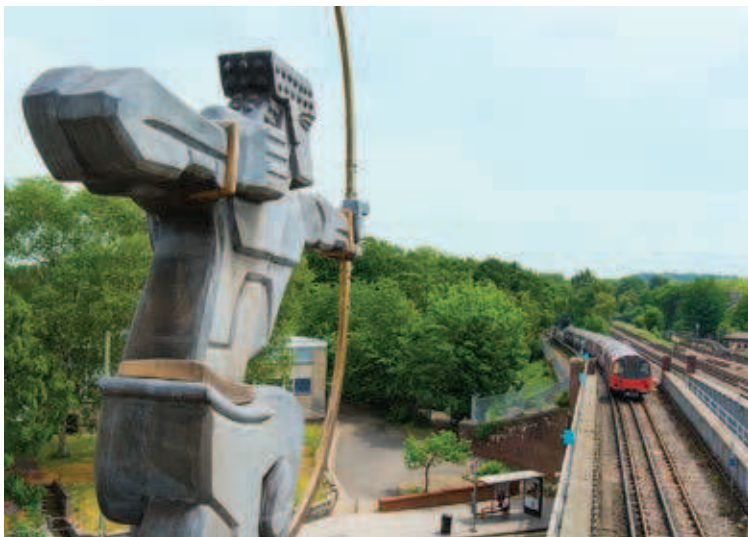
Archie points the way to Morden.

Archie: Yes apart from the old trouble in my inspection plate, all is tickety-boo. Well they do say 75 is the new 50, don't they?