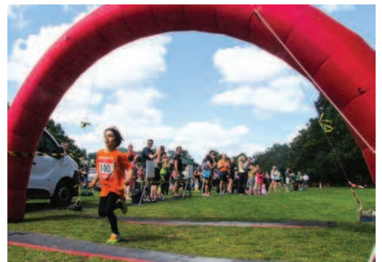
On the run: the youngest runner crosses the finish line