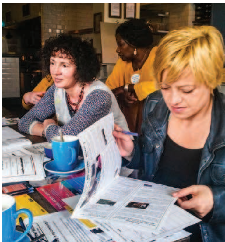
Friendly chat: A coffee morning under way at the Stag.

Back to the High Road Esso: all we can be certain of at the moment is that whatever the garage will be replaced with, it won't be a Tesco. What would readers like to see built on this site? Alternatively, what would you not want on this site? Email the-archer@lineone.net or let us know on Facebook and Twitter @TheArcherN2.