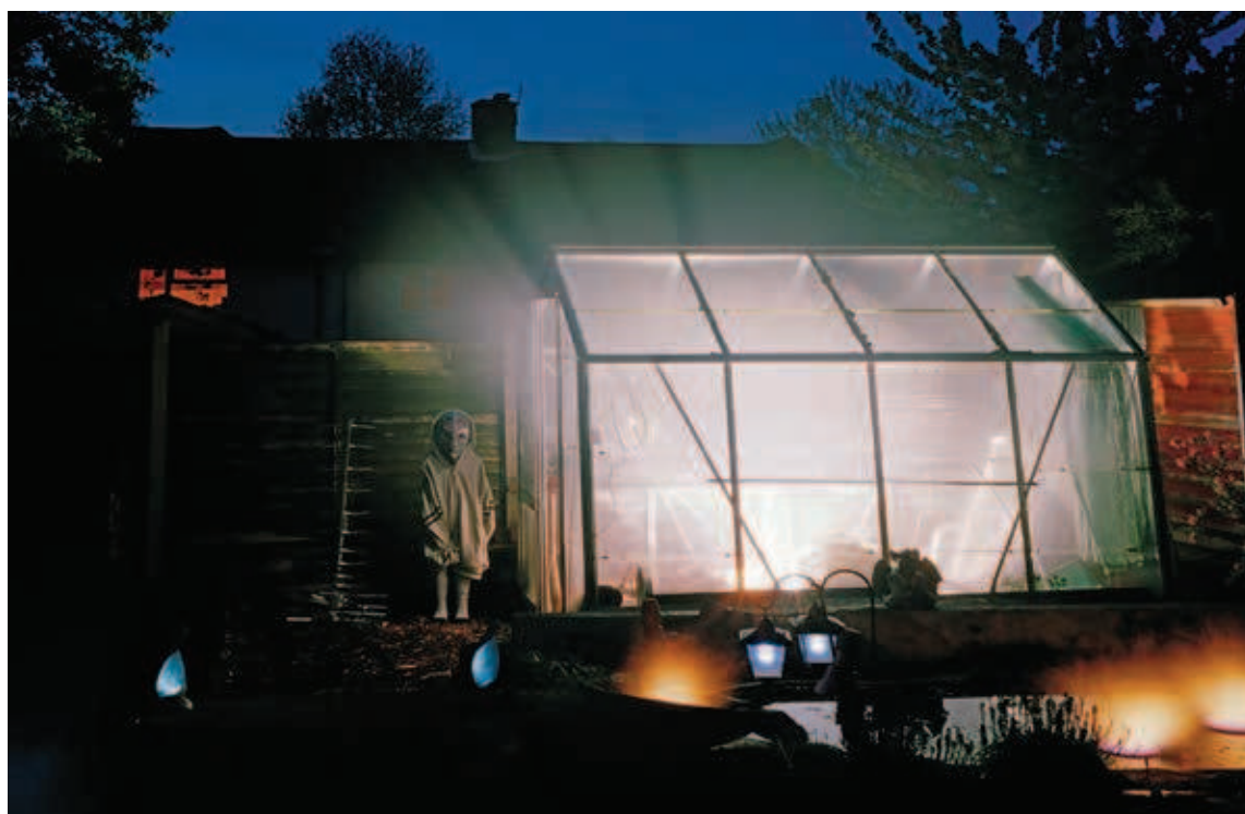
Greenhouse gas - the day the earth stood still (in East Finchley).

Members of the local East Finchley Open Artists group are having their 15th annual Open Houses weekends on Saturday and Sunday 4-5 and 11-12 July. In and around East Finchley houses and studios will be opening where you can enjoy, and maybe even buy, all kinds of art, ceramics and jewellery. See brochures and posters in local shops or log on to www.eastfinchleyopen.org.uk for a map of venues.