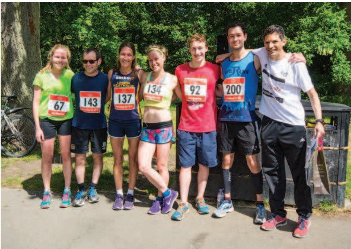
All the winners.

Did you take part in Race the Neighbours? Let us know what the race was like for you and whether you'd like to see it return next year. Email the-archer@lineone.net or find us on Twitter and Facebook @TheArcherN2.