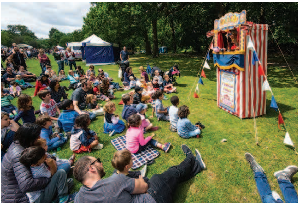
Punch & Judy.