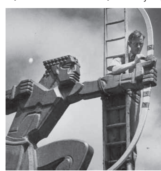
Eric Aumonier with Archie in 1940

Archie: Yes apart from the old trouble in my inspection plate, all is tickety-boo. Well they do say 75 is the new 50, don't they?