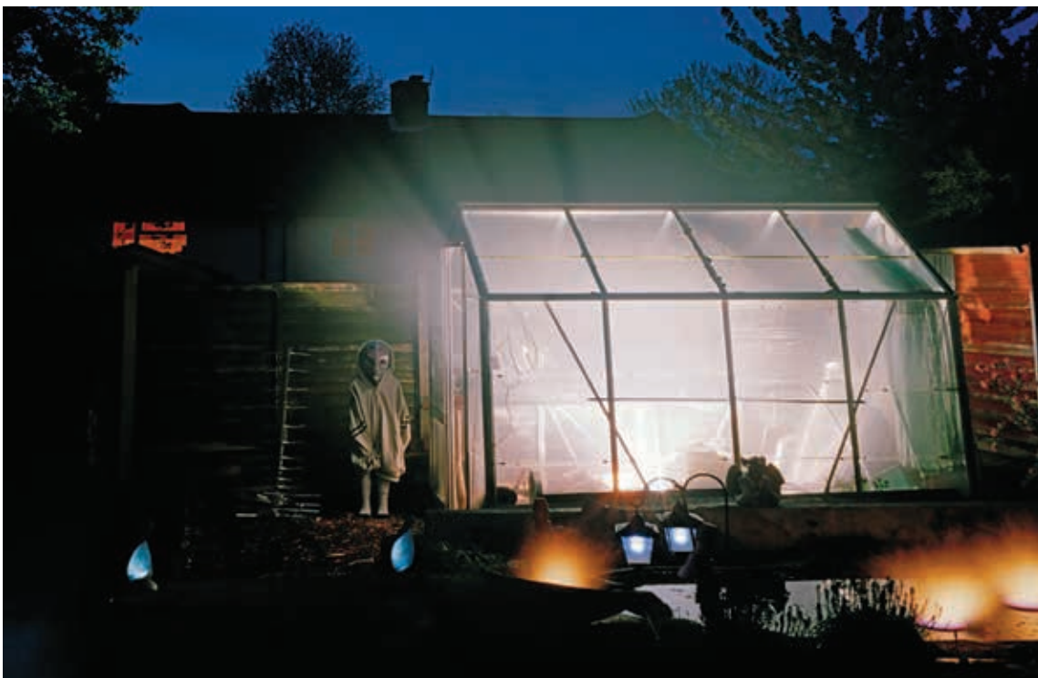
Greenhouse gas - the day the earth stood still (in East Finchley).

Members of the local East Finchley Open Artists group are having their 15th annual Open Houses weekends on Saturday and Sunday 4-5 and 11-12 July. In and around East Finchley houses and studios will be opening where you can enjoy, and maybe even buy, all kinds of art, ceramics and jewellery. See brochures and posters in local shops or log on to www.eastfinchleyopen.org.uk for a map of venues.