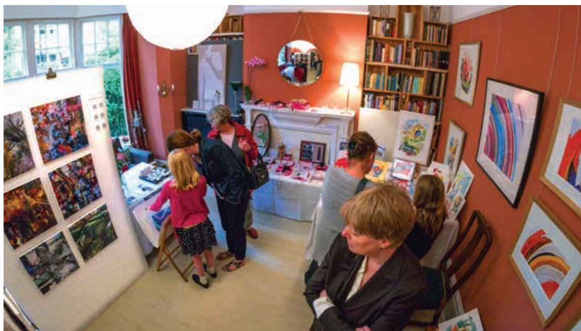
EFO artists' open house weekends are back this month.