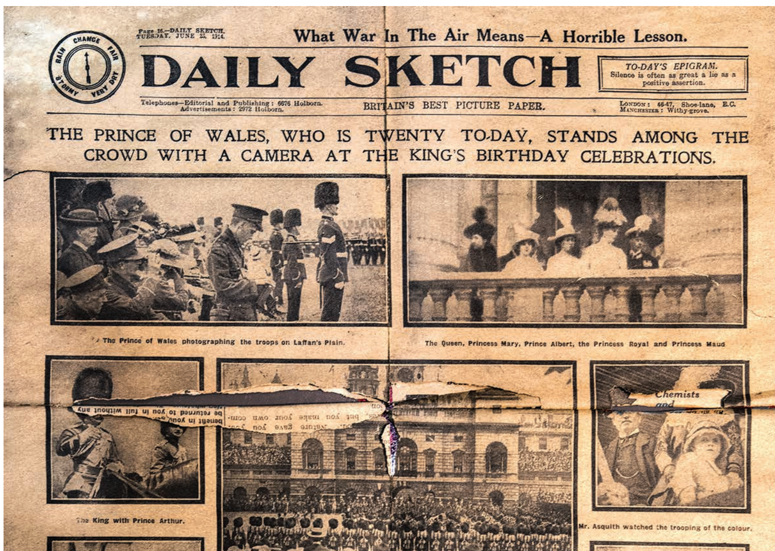
A detail of the 100 year old copy of the Daily Sketch found when The Exchange was being renovated.