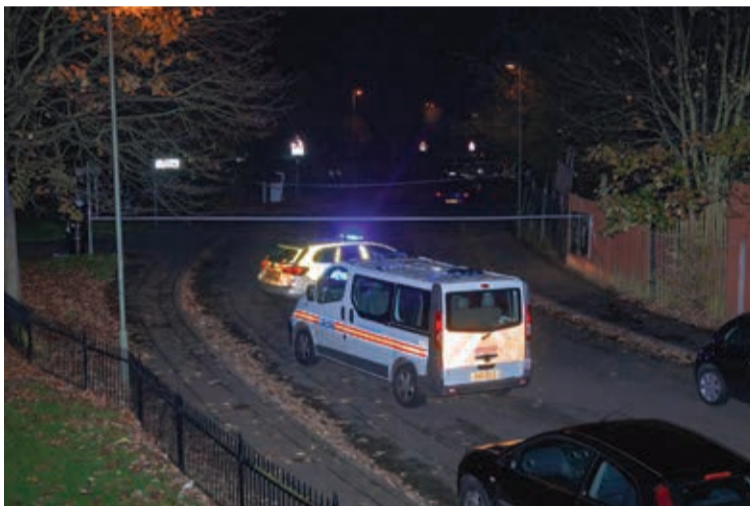
Sealed off: Police cordon off Simms Gardens after reports of a shooting.

The Trident and Area Crime Command is investigating and anyone with information is asked to call 101.