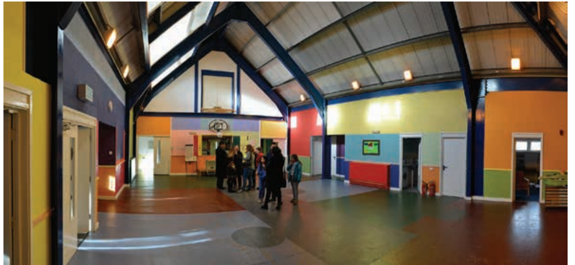
The Old Barn as it is currently (above) and the new plans (below)

"The design will provide shared space and facilities for community groups and meet the council's commitment to re-provide facilities to the Somali Bravanese Welfare Group, many of whom are local to the area, following the arson attack on their facilities," said a council spokesperson.