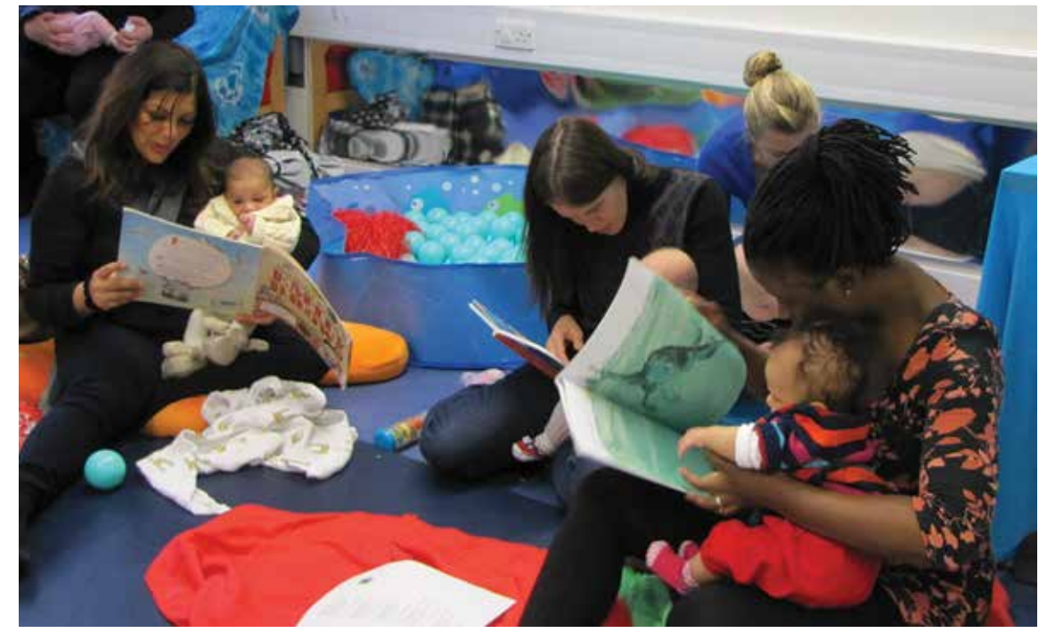
Page turners: Mums and babies enjoy reading time at the Highgate Family Centre