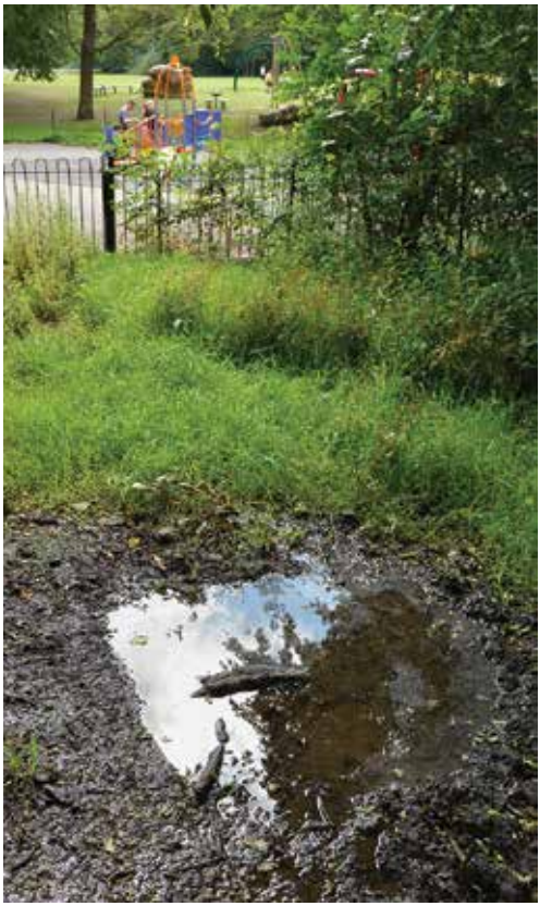
A large puddle of still water from a leak near the children's playground in Cherry Tree Wood.

tion again and further underlined the "health hazard with loads of mosquitoes breeding in the stagnant water very near where children are playing.'