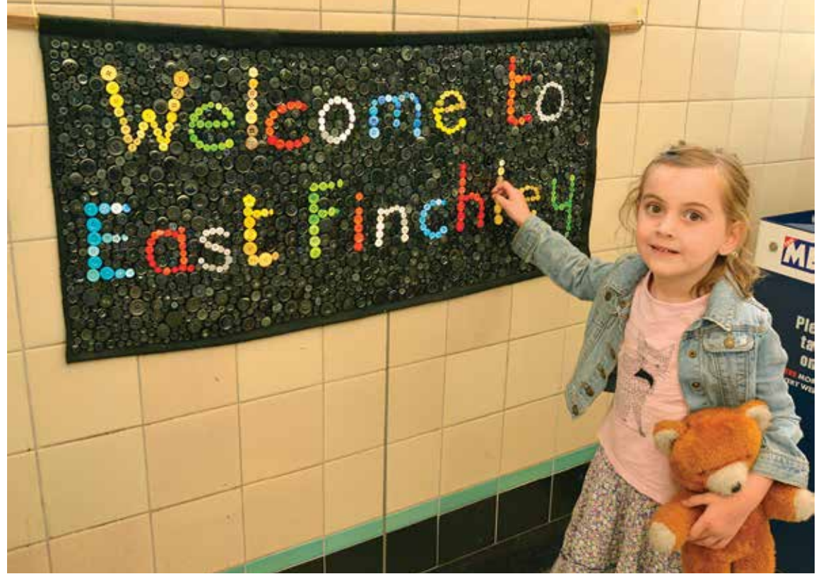
A young passenger enjoys a buttony welcome at the tube station.

Offer begins 1st August 2014 and ends 30th September 2014 Offer valid with this coupon, please present at purchase.