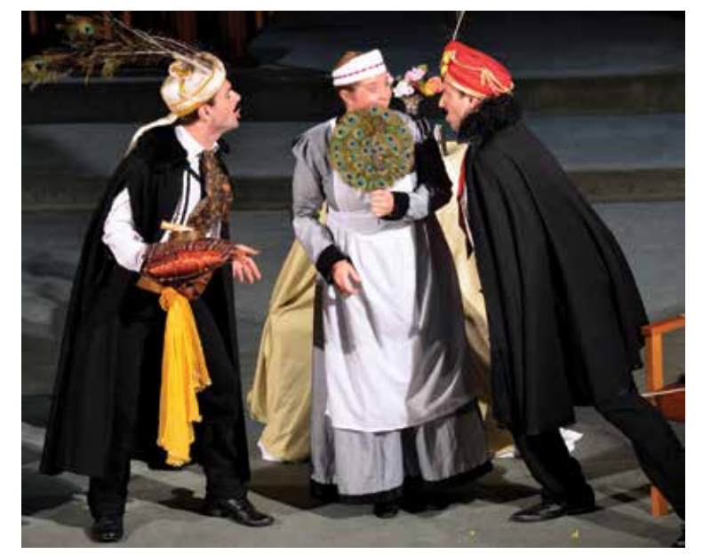
Pop-up opera - Mozart's Cosi fan Tutte.