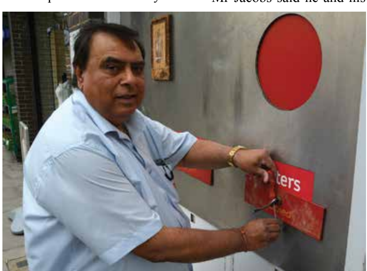
5.30pm, 21st May 2014, the Crown post office in East Finchley closes for the last time.

team are being closely audited and monitored by Post Office management. Their franchise is open-ended as long as they meet agreed levels of service and performance.