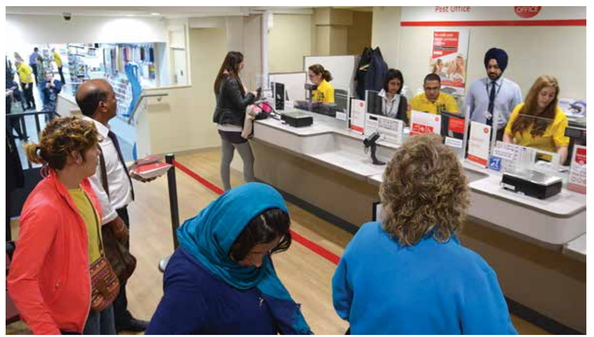
The first customer is served at the new post office in UOE.