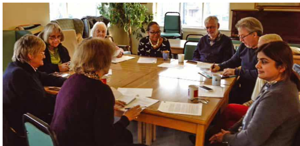
Make friends with a book.