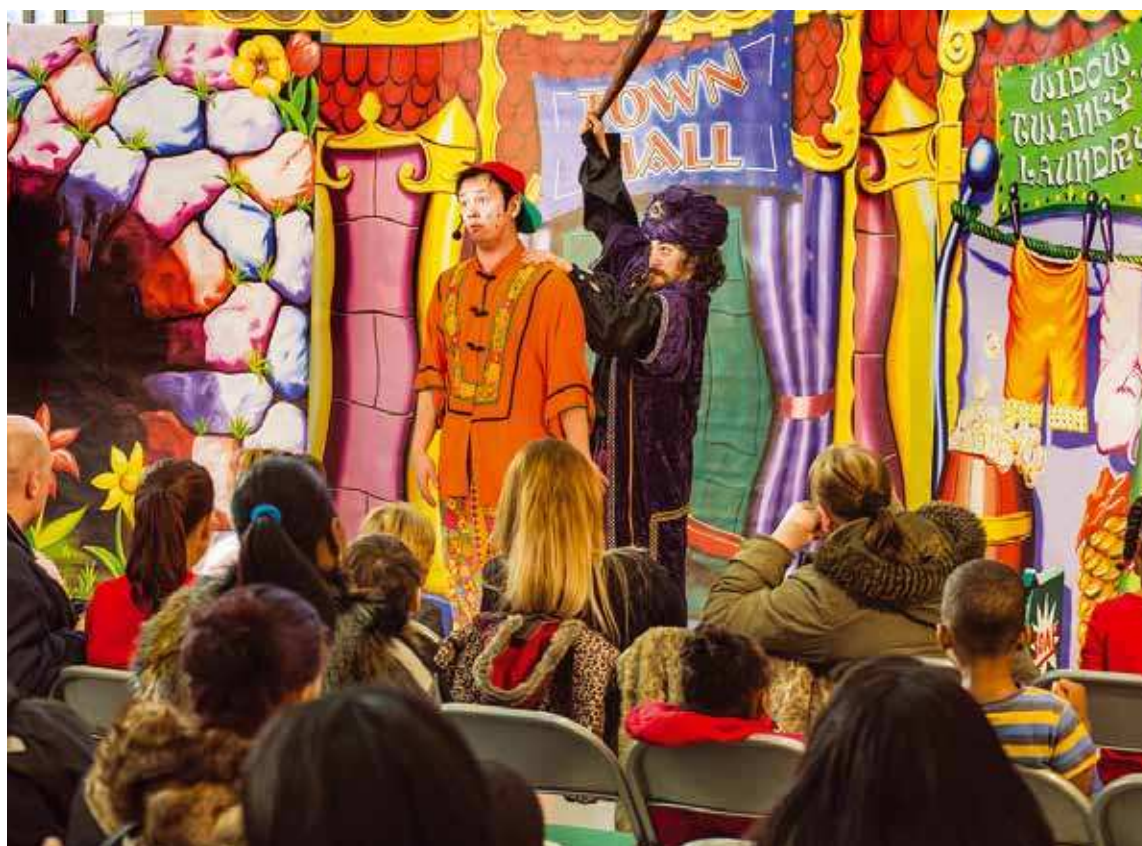
The Aladdin panto at the Green Man Community Centre.