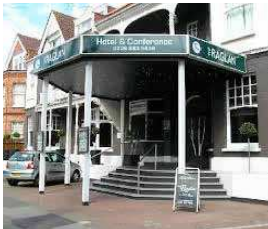
Music venue: The Raglan Hotel