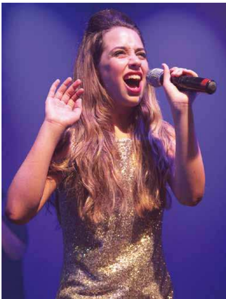
Could you be a star this summer?