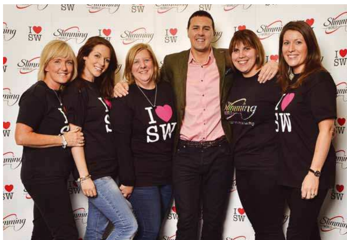
The Slimming World women with Paddy McGuinness.