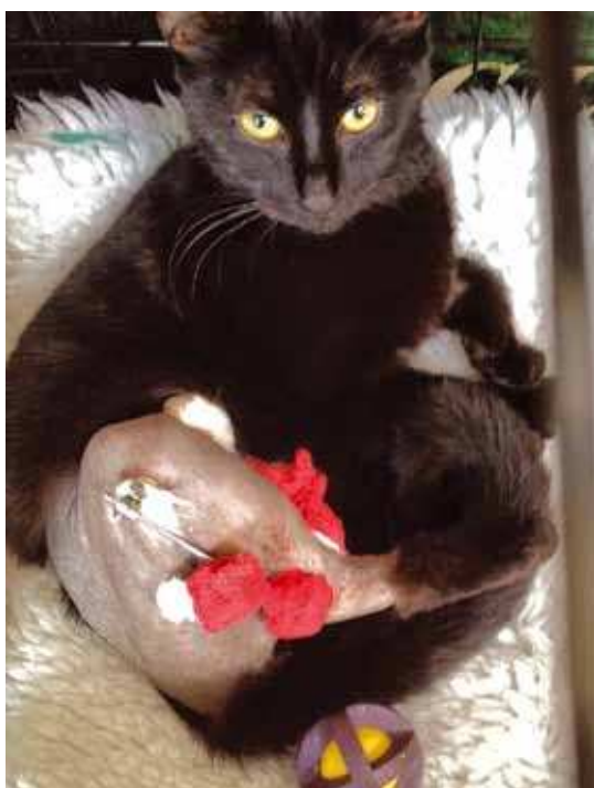
Moonshie the kitten, now confined to a cage until her leg heals

She now is on medication and needs cage rest for the next six weeks. I would like people to be made aware of all the pain and stress associated with the misuse of these guns.