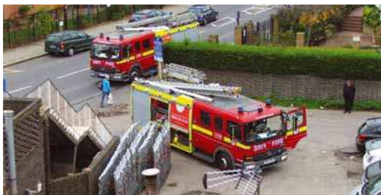
The Fire Service attending a fire at Viceroy Close in the centre of East Finchley.

A spacecraft measuring 10x10x10 cm and weighing less than 1kg is sending messages to the National Radio Centre at Bletchley Park. Launched in Russia last November, it transmits data about its position, temperature, atmospheric conditions and battery performance to monitoring stations around the world. Working with schools and colleges, it's intended to educate and inspire children and teenagers "for many years to come".