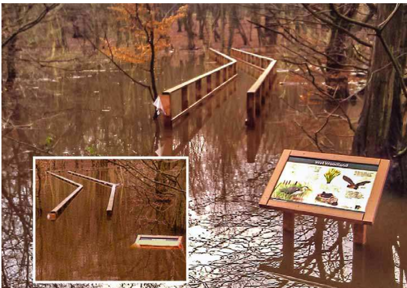
Coldfall Woods in flood.