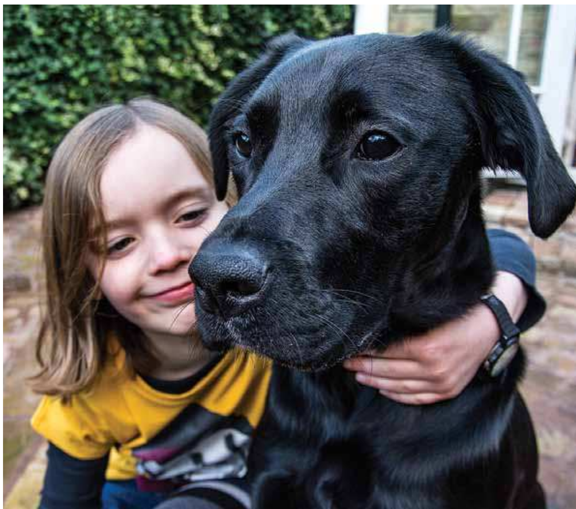
Meet Rufus, our pet of the month. Turn to page 11 for our new regular feature.

Feel free to drop in to find out more about groups you might want to join, or leave