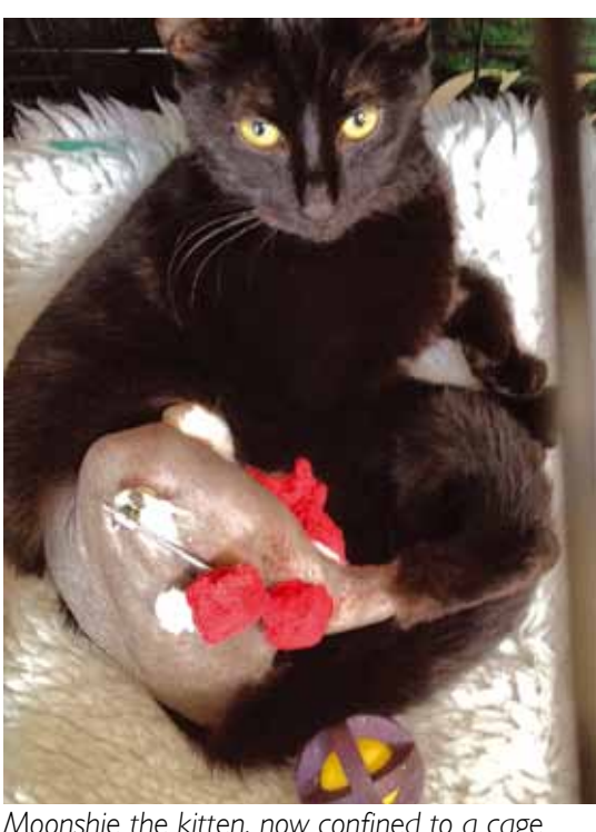
Moonshie the kitten, now confined to a cage until her leg heals

She now is on medication and needs cage rest for the next six weeks. I would like people to be made aware of all the pain and stress associated with the misuse of these guns.