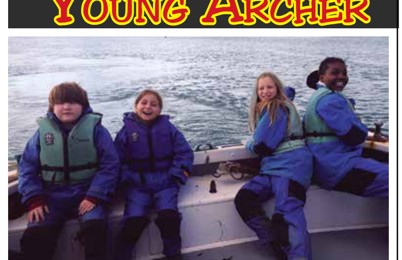
All aboard: Coldfall Primary children on their maritime adventure week in Essex.