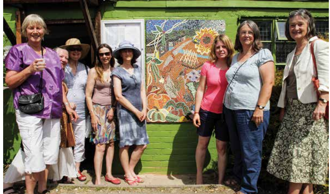
Perfect fit: The East Finchley Allotments mosaic team with their creation.