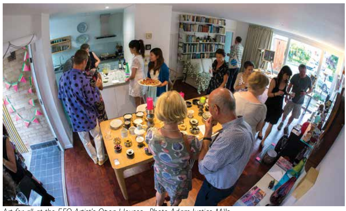
Art for all at the EFO Artist's Open Houses.

A community newspaper for East Finchley run entirely by volunteers.