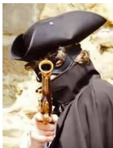
Highway robbery: Bring back the gibbet?

Road shops. It will act as a great gateway into East Finchley.