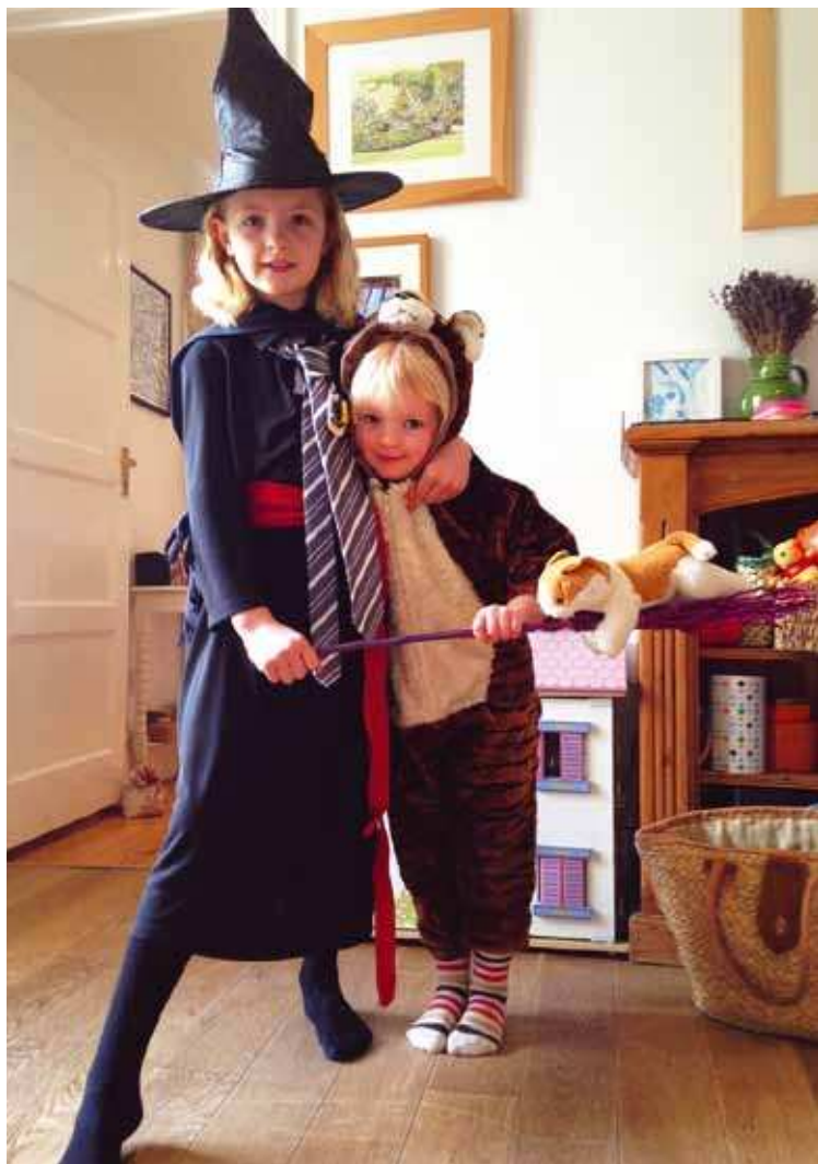
All dressed up for World Book Day.