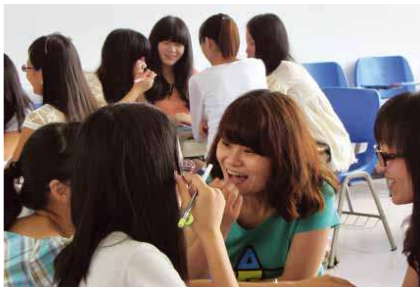
An oral English lesson in full swing.

The classrooms for Oral English were very basic: movable seats and a blackboard, with no heating. In winter students and teachers sit in class wearing their coats. Similarly there was no air conditioning in the summer, when temperatures often reach the high 30Cs.