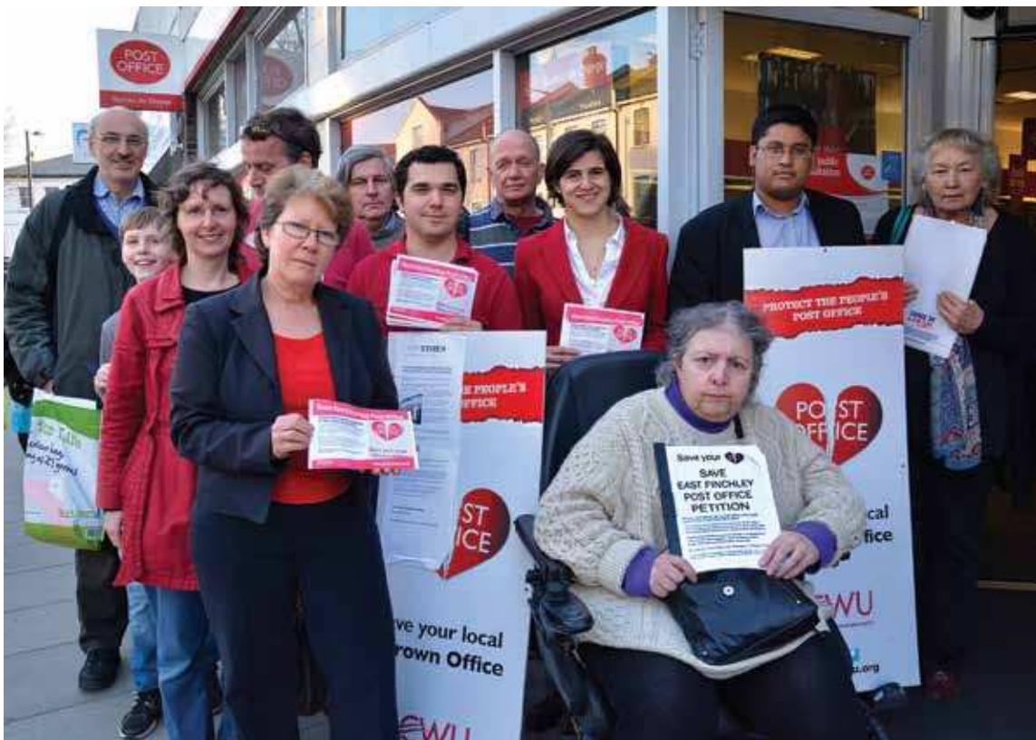
Campaigners gather outside the Post Office.

A community newspaper for East Finchley run entirely by volunteers.