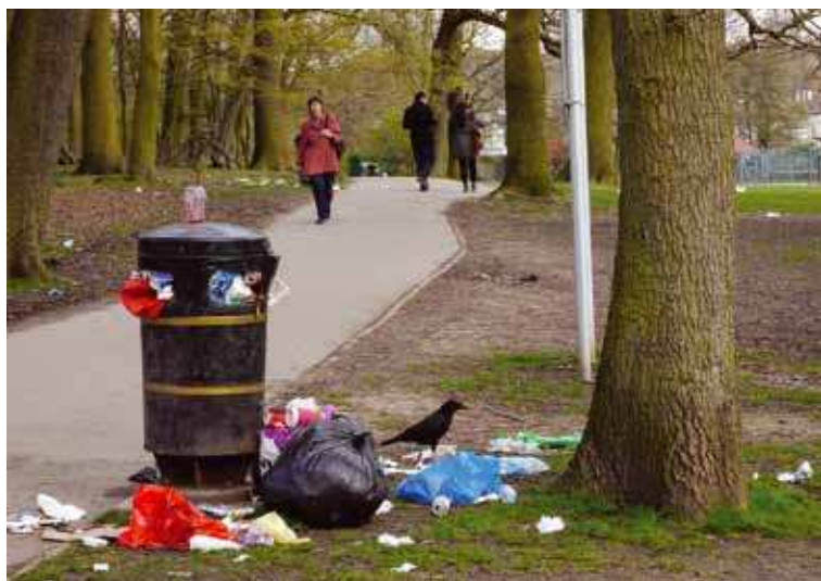
Unemptied bins in Cherry Tree Wood.