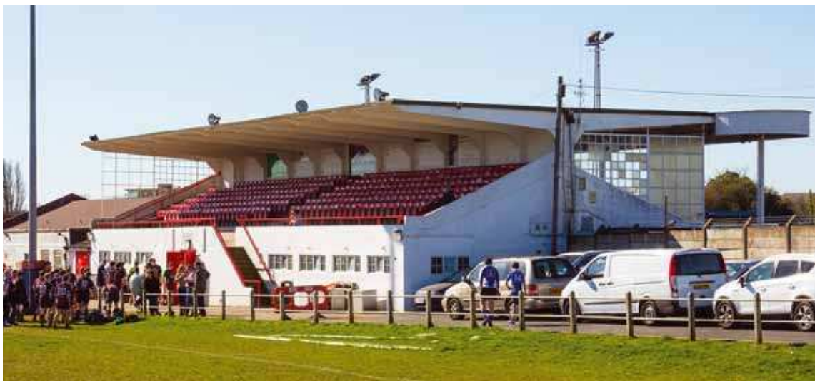
Finchley's double cantilever grandstand.