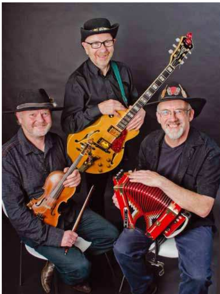
The Creole Brothers