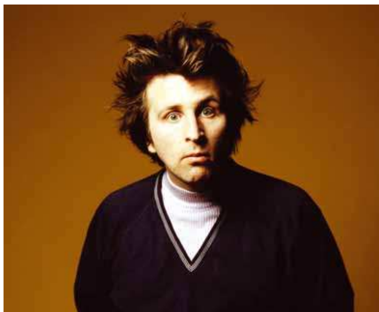
Mock the Week regular, Milton Jones