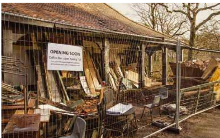
Cherry Tree Wood pavilion as of 1st March.

After Easter, when the summer schedule starts, cleansing operators should tour the borough's parks on Saturdays and Sundays thus reducing the chances of this recurring. Another solution would be for everyone to take their rubbish home with them.