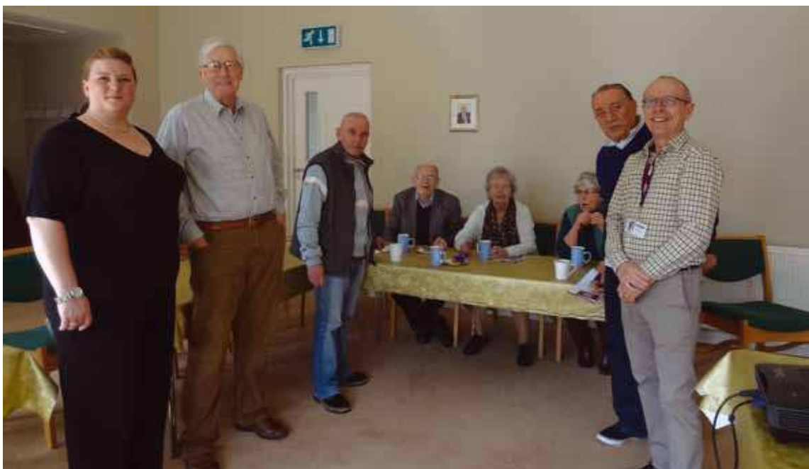
One of the anti-scaming workshops under way.