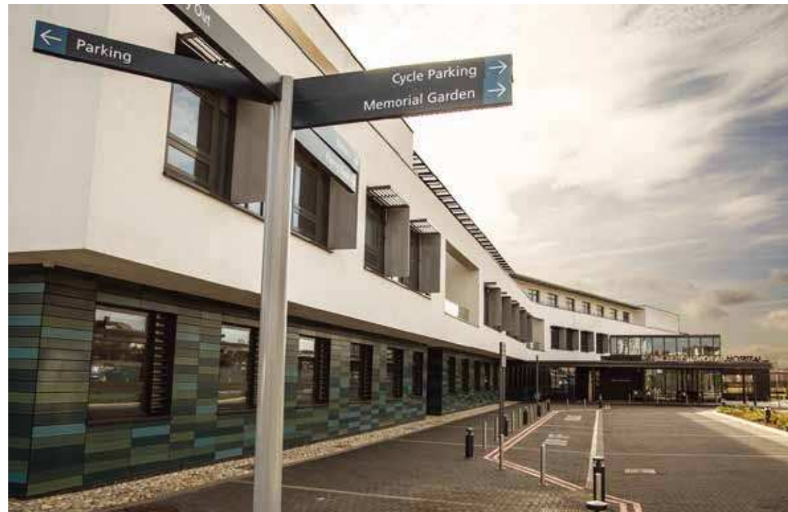
New hospital but no public transport.

The movement to get a bus service to Finchley Memorial Hospital is gathering momentum. Here are two ways to get involved and make your voices heard.