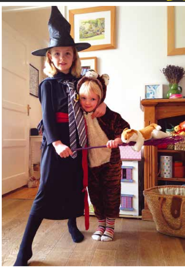
All dressed up for World Book Day.