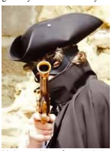
Highway robbery: Bring back the gibbet?

Road shops. It will act as a great gateway into East Finchley.