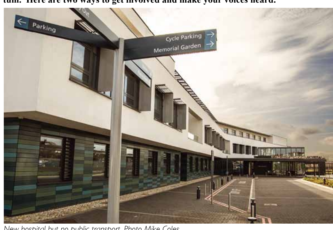
New hospital but no public transport.

The movement to get a bus service to Finchley Memorial Hospital is gathering momentum. Here are two ways to get involved and make your voices heard.