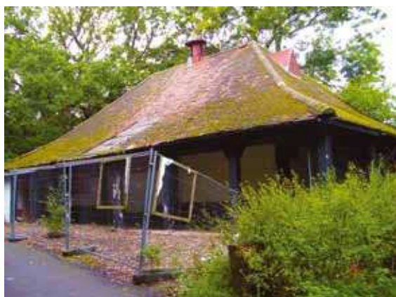
A blot on the landscape?

some see it as a potentially damaging to the area, bringing unwanted traffic, noise, smells and security problems, others feel that the refurbishment of the pavilion will turn what has become an eyesore into an attractive and useful facility for park users.