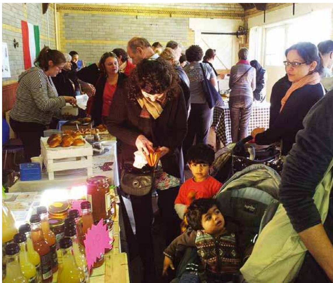
The artisan market in full swing at Avenue House.

To book your free ticket email martinprimary100@gmail.com or Tel: 020 8883 1455 www.martinprimary100.org