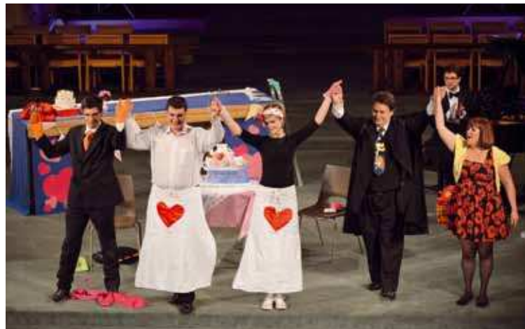
A scene from last year's Arts Festival.

Learners are helped to select the career which is best