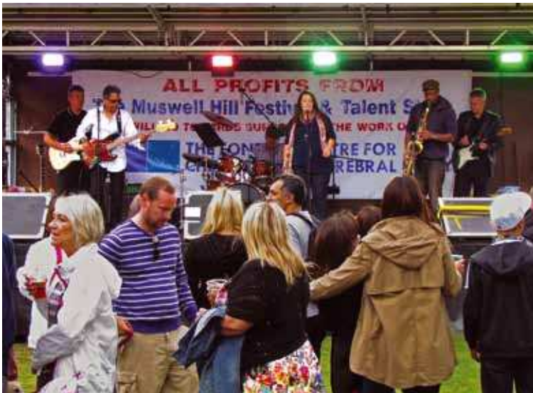
Local band The Roadrunners were making their debut at the festival and in fact it was the first time they had played together in public. The crowd loved their performance.