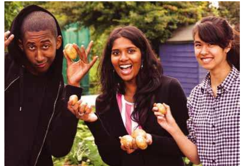
Three of the Challenge Network students show off the potatoes they dug up at Vale Farm Allotment.