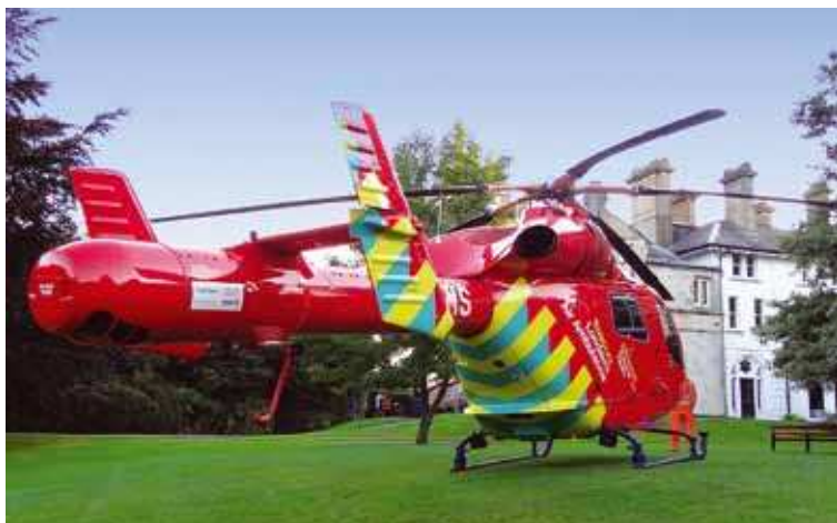
The air ambulance in the grounds of Avenue House.

The driver of the car, a man in his 70s, stopped at the scene while several passers-by tried to administer help. The air ambulance landed in the grounds of Avenue House while police and paramedics rushed to the scene.