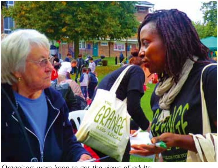
Organisers were keen to get the views of adults.

If you have any information about any of these burglaries, please call the police on 101. If you want to remain anonymous, please call Crimestoppers on 0800 555111