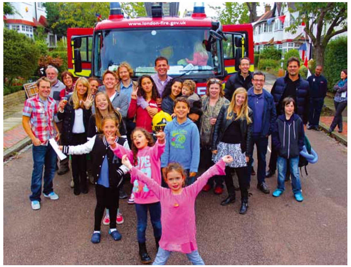
Fun with the firemen.