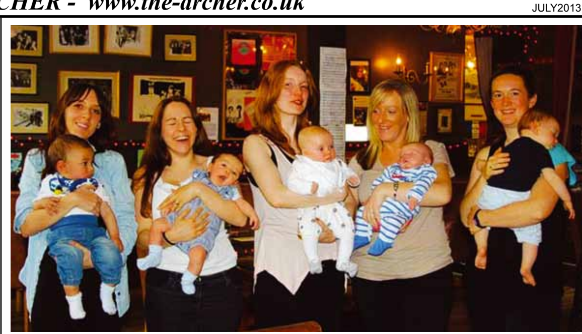
The mums and babies meet up at the Clissold Arms

If you have any information call the incident room on 020 7230 2299 or ring Crimestoppers on 0800 555 111 if you want to remain anonymous. Police are particularly keen to find out whether the letters EDL were seen on the building before the fire.