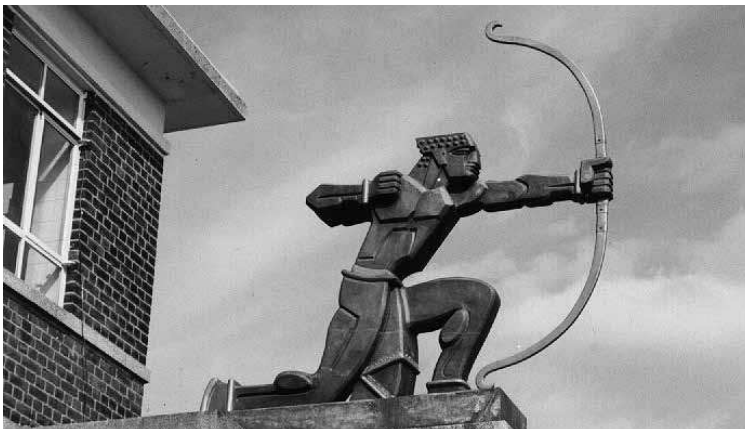
'Archie'

"Brilliantly sited, fantastically realised, impishly styled and enduringly relevant, the archer sums up pretty much everything worth celebrating about the Underground," says blogger