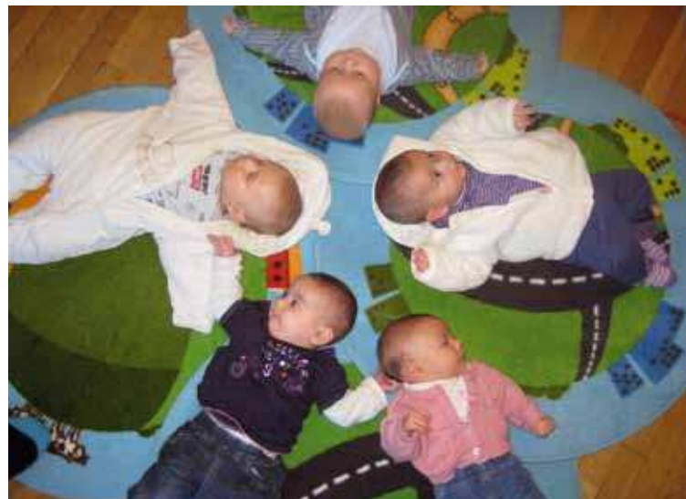
Circle of life: Parents and babies can benefit from massage sessions.

"Also as a parent, you literally have the tools at your