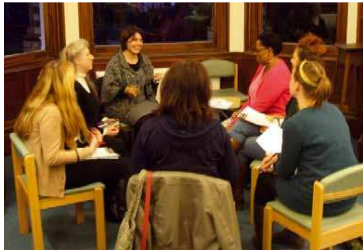
The Creative Writes group get creative.

For more information on our programme, check our website www.phoenixcinema.co.uk or call the box office on 020 8444 6789.