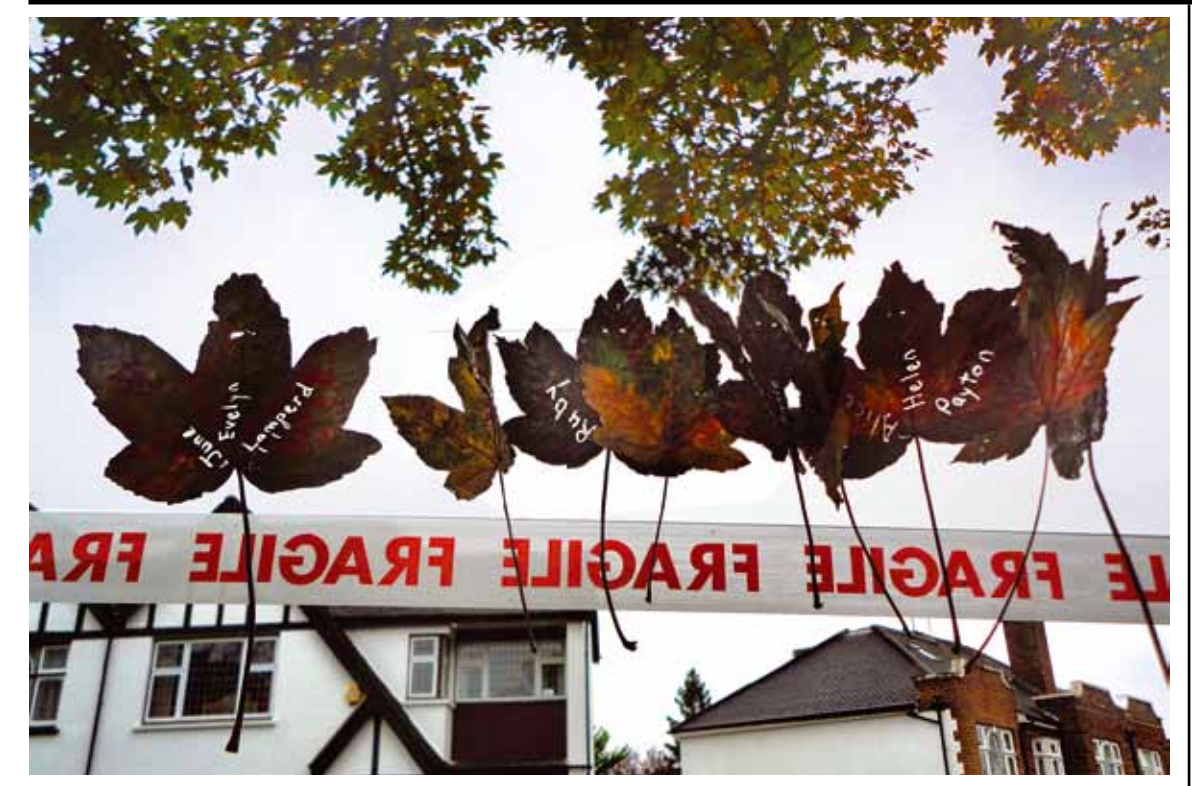
Artist Nick Scammell's installation in Abbott's Gardens.