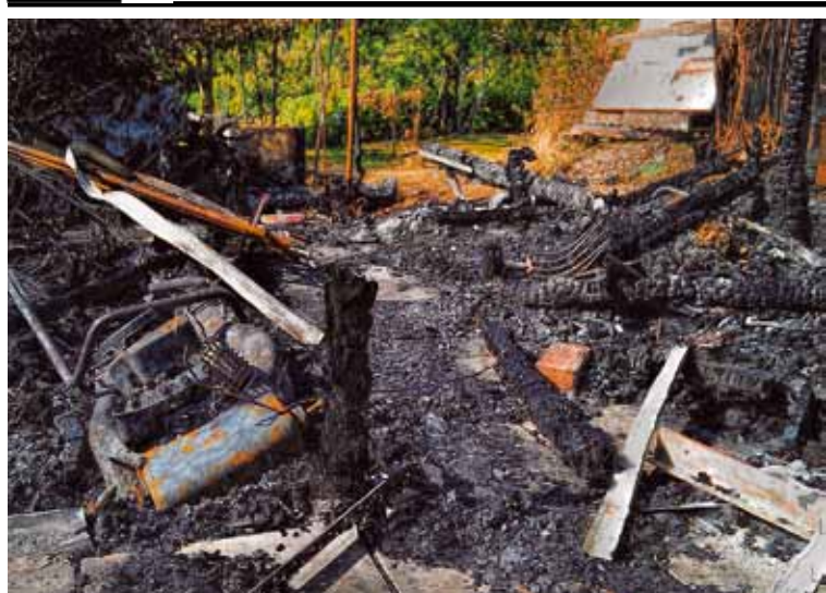
The charred remains of the shed at East Finchley Allotments.