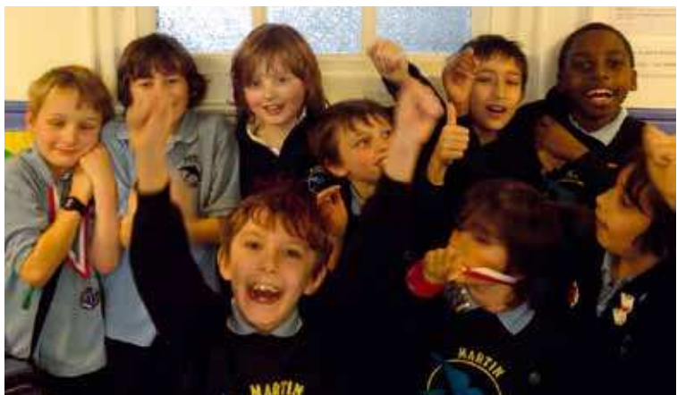
Checkmate! The Martin School under-9 chess team