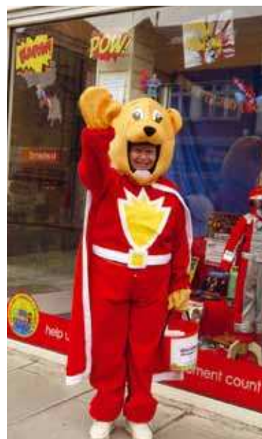
Could you be a superhero for Noah's Ark Children's Hospice?

Visit www.noahsarkhospice.org.uk for more information and to download fundraising resources. To donate to Noah's Ark Children's Hospice during Children's Hospice Week, visit www.justgiving.com/childrenshospiceweek .