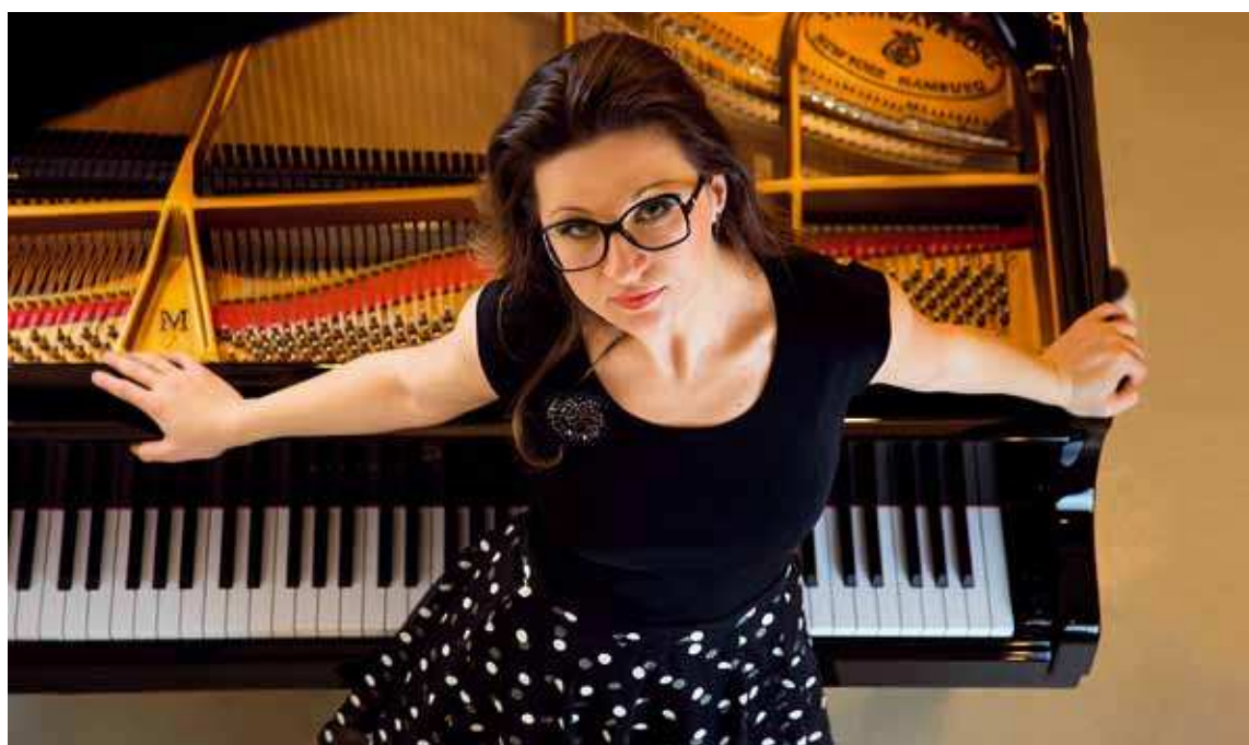
Piano queen: Yllka Istrefi.