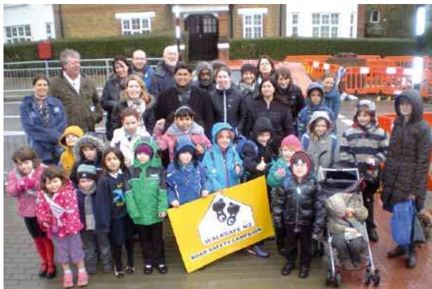
Safer walking: Walksafe campaigners celebrate the new Creighton Avenue crossing.

A number of people have raised concerns with Walksafe about pedestrian safety in other locations. The group have posted some tips on their Facebook page.