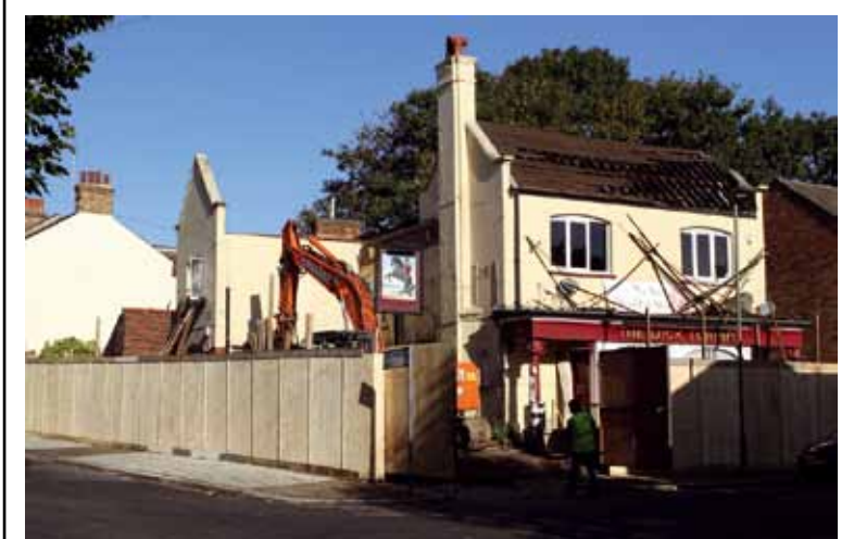
Closing time: the final days of the Dick Turpin in Long Lane.

The George was rebuilt in the 1890s and survived until 2001 when it was demolished and replaced by the housing block that stands there now. These then-and-now shots come from the council's Past and Present project, which allows smartphone users to download images at the location in question, from QR codes posted on lampposts.