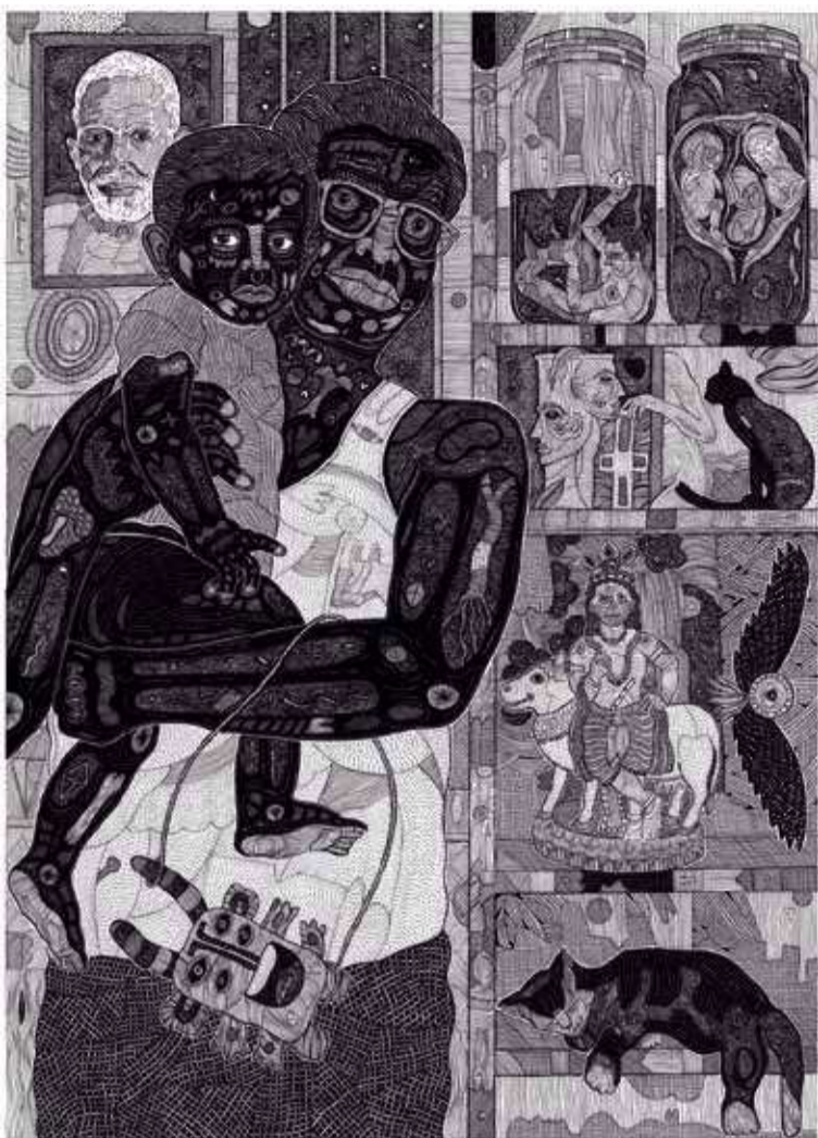
Ravi Shankar's work exhibiting at The Noble Sage