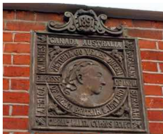
The 1897 plaque in celebration of Queen Victoria's Diamond Jubilee.

While we celebrate Queen Elizabeth's Diamond Jubilee, next time you take a walk down Bedford Road, look out for an ornate plaque marking 60 years on the throne for her great-great-grandmother—Queen Victoria.