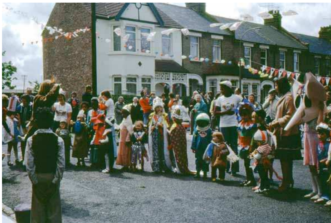
The fancy dress competition gets underway at the 1977 Silver Jubilee street party in Richmond Road.