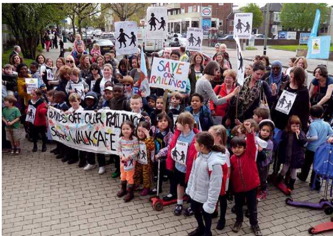
Parents and children demonstrate against the loss of their safety railings.