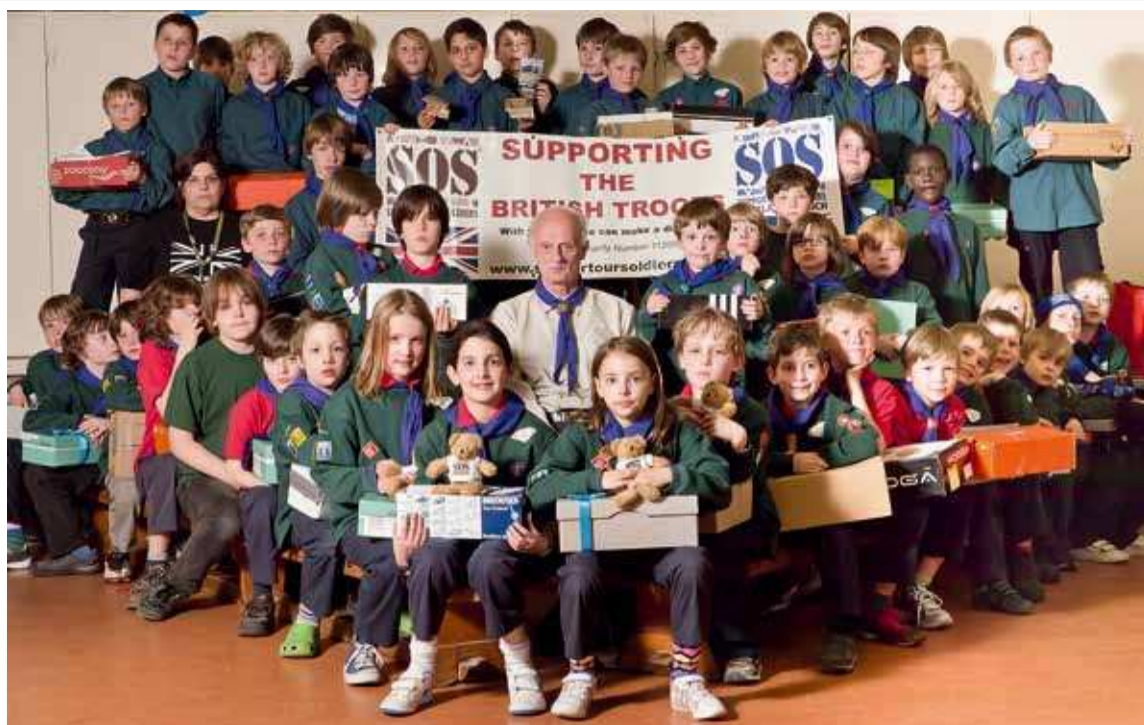
The 8th Muswell Hill Scouts have been sending treats to soldiers in the field.