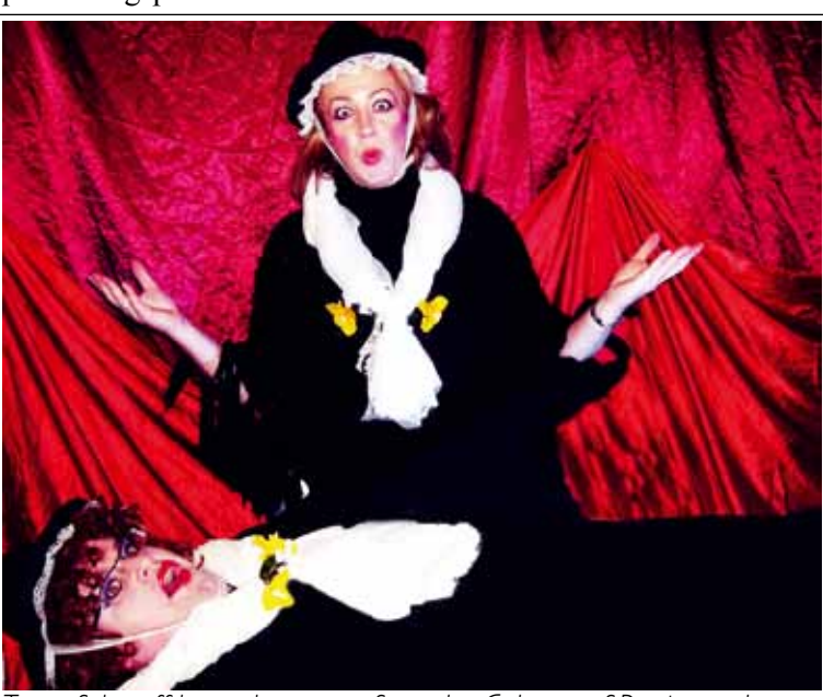
Two of the off-beat characters from the Cabaret of Pottiness show.

A colourful Ally Pally, the monumental Hornsey Town Hall and the smart new exterior of the Phoenix itself were among the other subjects of her work. Natasha's exhibition finished in early July but you can see examples of her work online at http://nb-prints.blogspot.co.uk